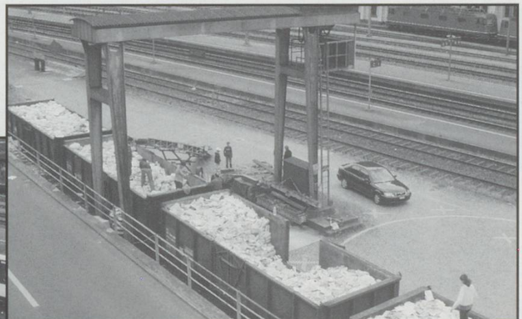
ABOVE: Taken once again from the Frohsinn but this time at 14.00 as the paper chase was well under way.