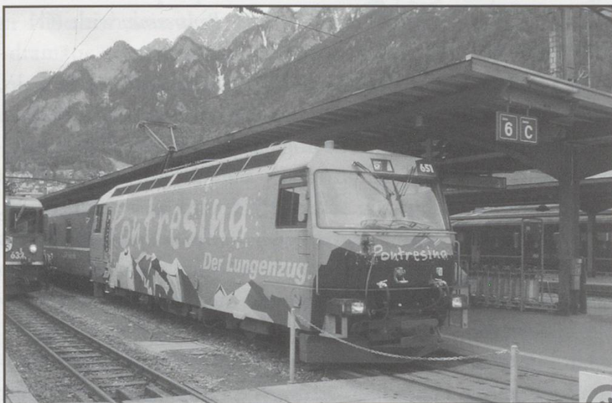
LEFT: Ge 4/4 III 651 Pontresina prepares to depart for St Moritz, 23/01/2002.

sional experience of shunting operations and the way SBB do it – an 8 coach train backing out of the station with apparently nobody at the leading end, and a driver happily driving his long train backwards at speed!