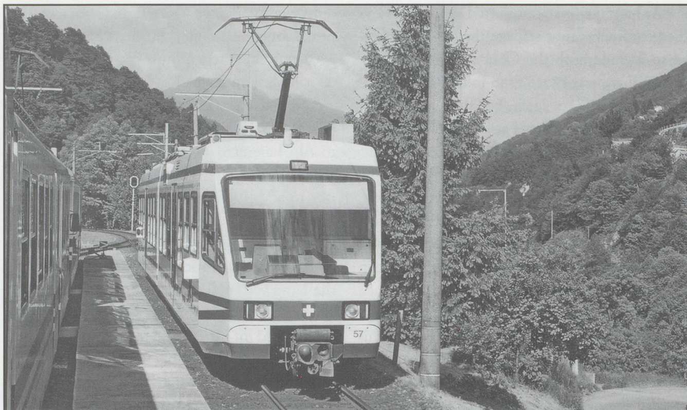
A Centovalli ABe4/6 departs a passing loop on this wonderful and scenic line May 2001.