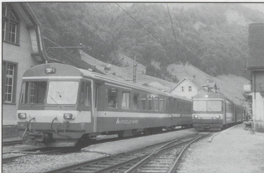
End of the line. The AB's Wasserauen terminus on 30 August with the peaks of Alpstein beyond. Actually this is quite an unusual picture as there are rarely two trains here at one time. It's an extensive if somewhat deserted terminus for most of the time.

Next day was allocated for journeys on the Appenzeller Bahn, using an AB Tageskarte, half price thanks to EuroDomino. The AB's southern extremity at Wasserauen lies on the fringe of the Alpstein massif, so we took advantage of this by a mountain walk up to Seealpsee. This just left time for a journey to Urnäsch and back before savouring one of AB's best-kept secrets: the steep rack-assisted line from Gais with its panoramic views across to Austria before it plunges down to Altstätten Stadt. Back at St Gallen we took advantage of Thursday late opening for an excellent meal in the Migros supermarket restaurant.