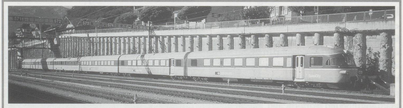
The "Grey Mouse", ex - RAe-TEE set No 1053, now owned by the "SBB Historic" trust, is seen here in Spiez in June 2002. It is awaiting restoration and painting into the old TEE livery of burgundy and cream by the BLS carriage Works in Bönigen. The engines will be treated at the BLS Depot in Spiez. The BLS won the restoration contract on the open market, but it did raise some eyebrows within the SBB... TEXT - George Hoekstra