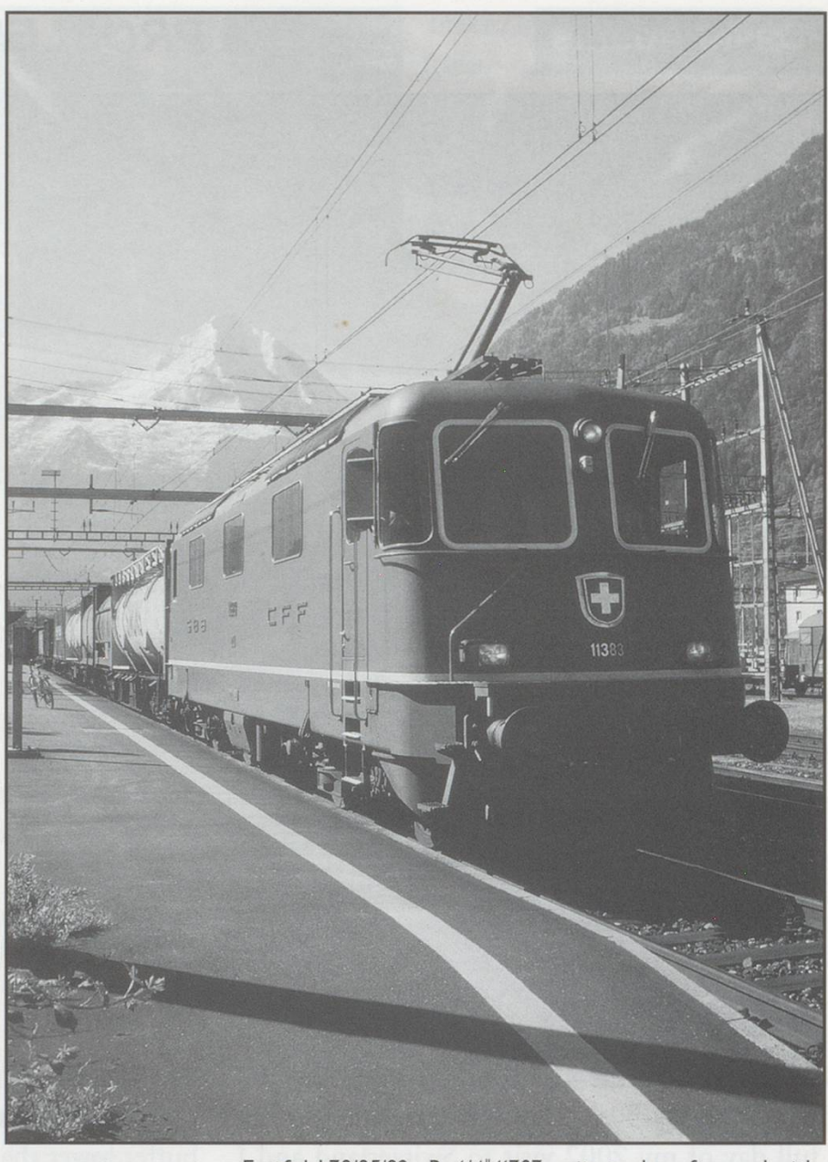
Erstfeld 30/05/02 - Re4/4" II383 waits to draw forward with the rear four vehicles of the S/B intermodal to start the re-marshalling move.

that had eluded me on my last three Swiss visits, a walk to Flüelen along the Axenstrasse which I will describe in more detail in another piece.