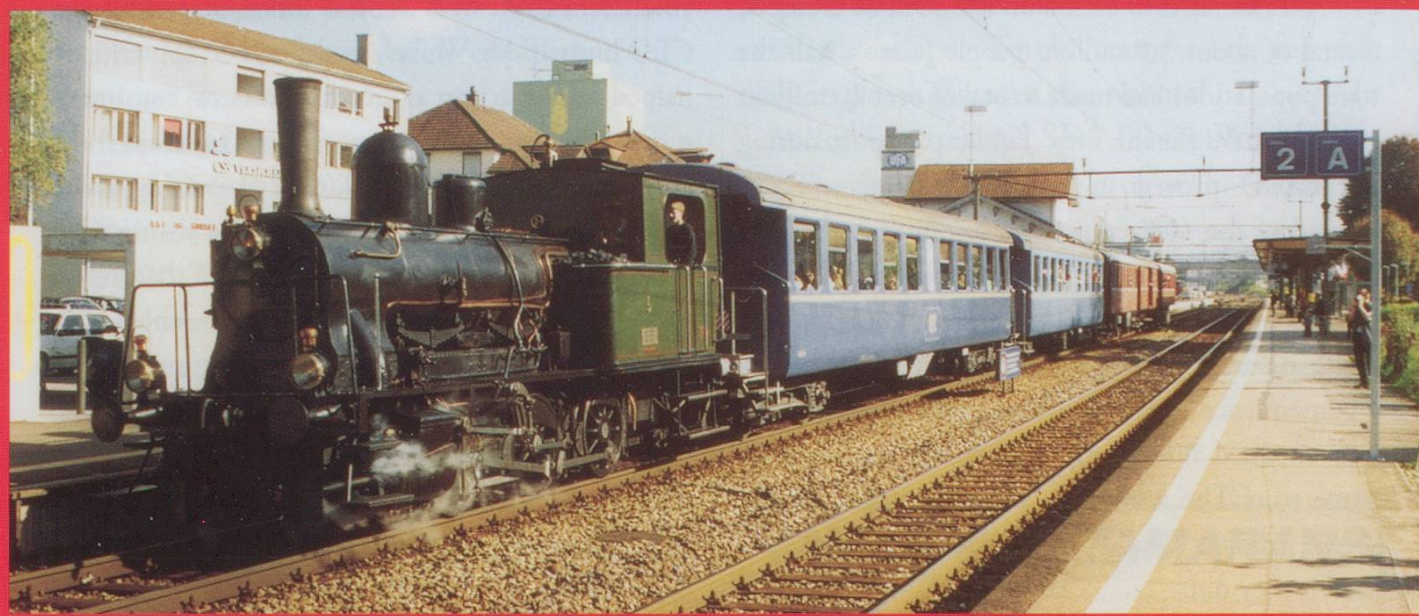
ABOVE: No. 5 heads off from Sursee on the Luzern - Basel main line to branch off to Triengen