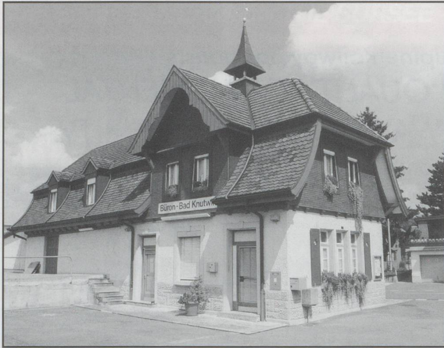
The attractive station at Büron

is a converted van. It has two long marble-topped tables in the centre with loose chairs around, and wrought iron railings protecting the open doors in each side. In the yard next to the station restaurant (well worth a visit at any time, excellent food, tea with cold milk, lots of railway and road artefacts) were stands with ST articles for sale, an open-air barbecue with typical Swiss sausages, cutlets and more sausages, and a tent with benches and tables for even more food and drink. Various children's attractions were also laid on, rides, games, and this gave a clue to the success of the event; it is obviously a huge favourite as a family event with very few train-spotters at all! Another coach was parked as a Raclette buffet, and I had a freshly prepared potatoes and melted cheese meal with beer before managing to squeeze onto the five coach train, and off we went.