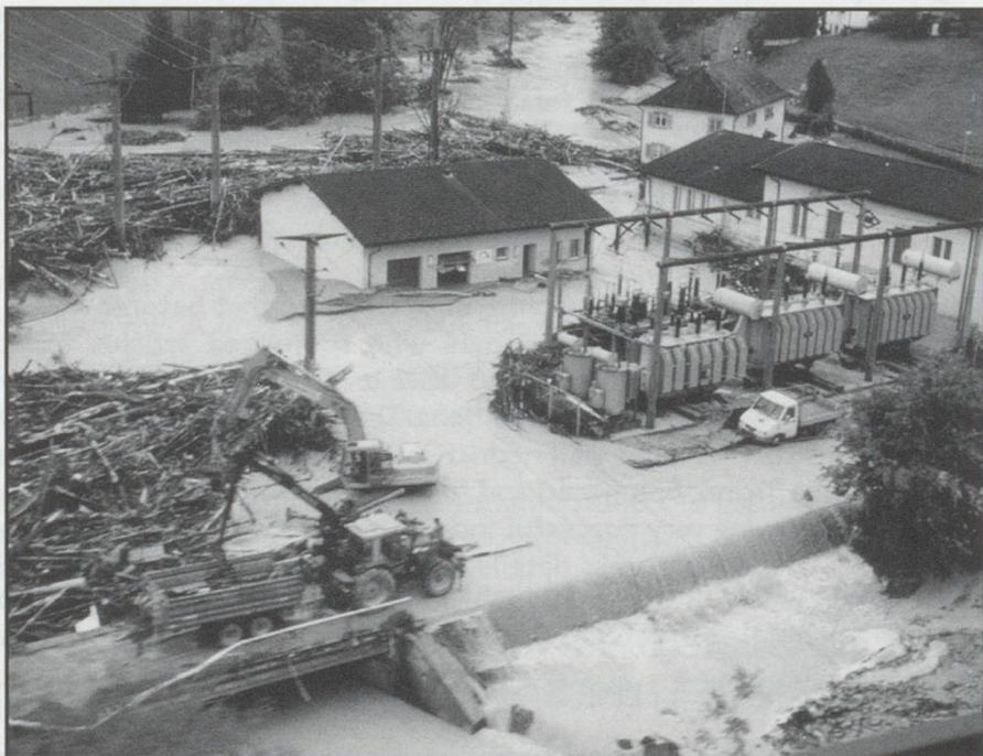
The electric power depot near Goldach, the morning after the flash flood. Taken from the train to St Gallen, 1/9/02 by Malcom Hardy-Randall

With effect from 14th October 2002, the former MThB/Lokoop locomotives Ae 477 900 - 913, 915 - 917, 930 have been renumbered Ae 411 001 - 018 in the SBB series, whilst Re 486 651 - 656 have become Re 481 001 - 006. Ae 476 012 (formerly SOB Ae 476 468) becomes Ae 012 042. All are allocated to SBB Cargo. It is believed that the Red Arrow