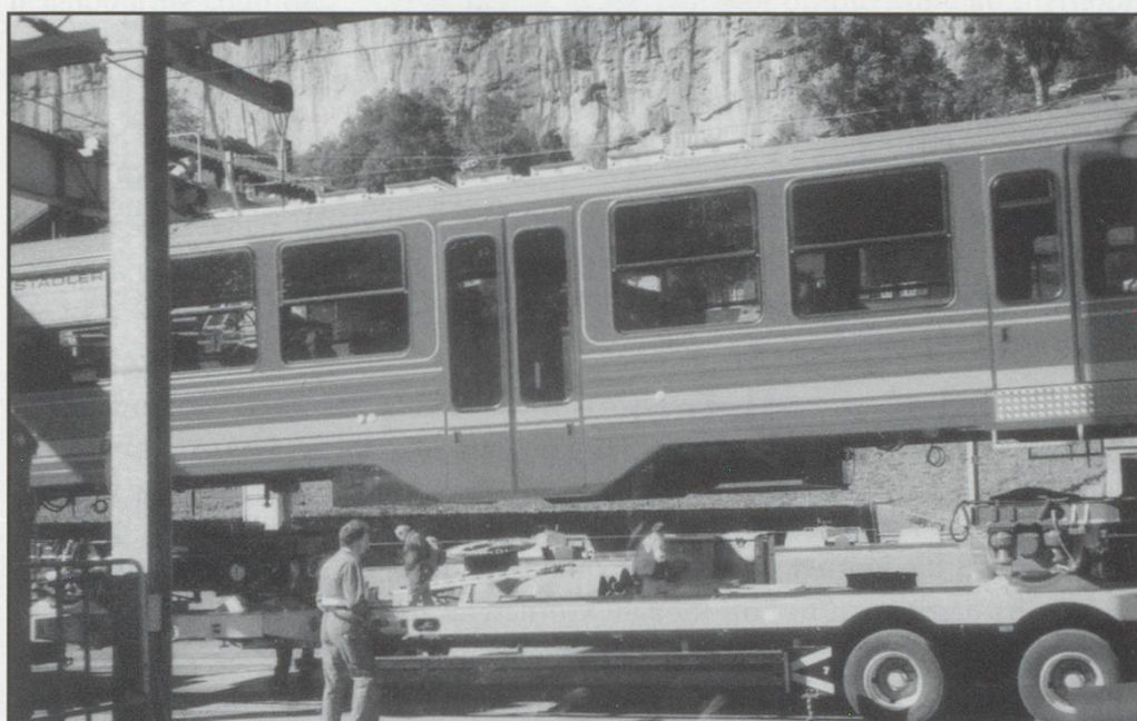
A new Stadler Jungfrau Unit being lifted off an articulated lorry trailer at Lauterbrunnen. The photo was taken from a WAB train entering the station, 17/09/2002.