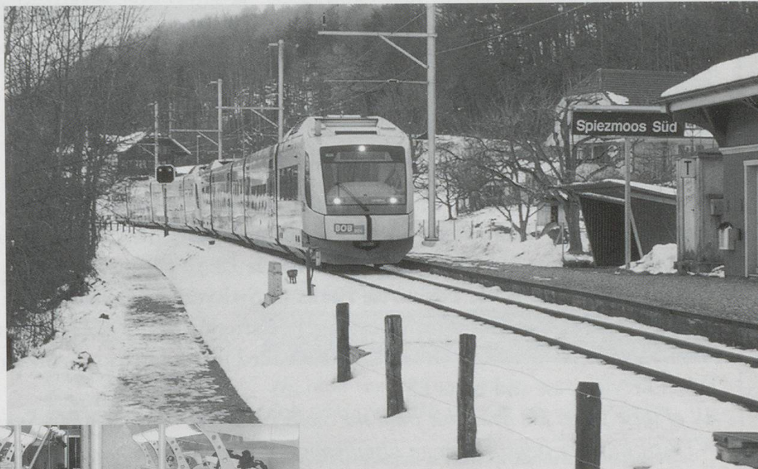
The Bavarian Integral units roar (literally) past the picturesque halt of Spiezmoos Süd.