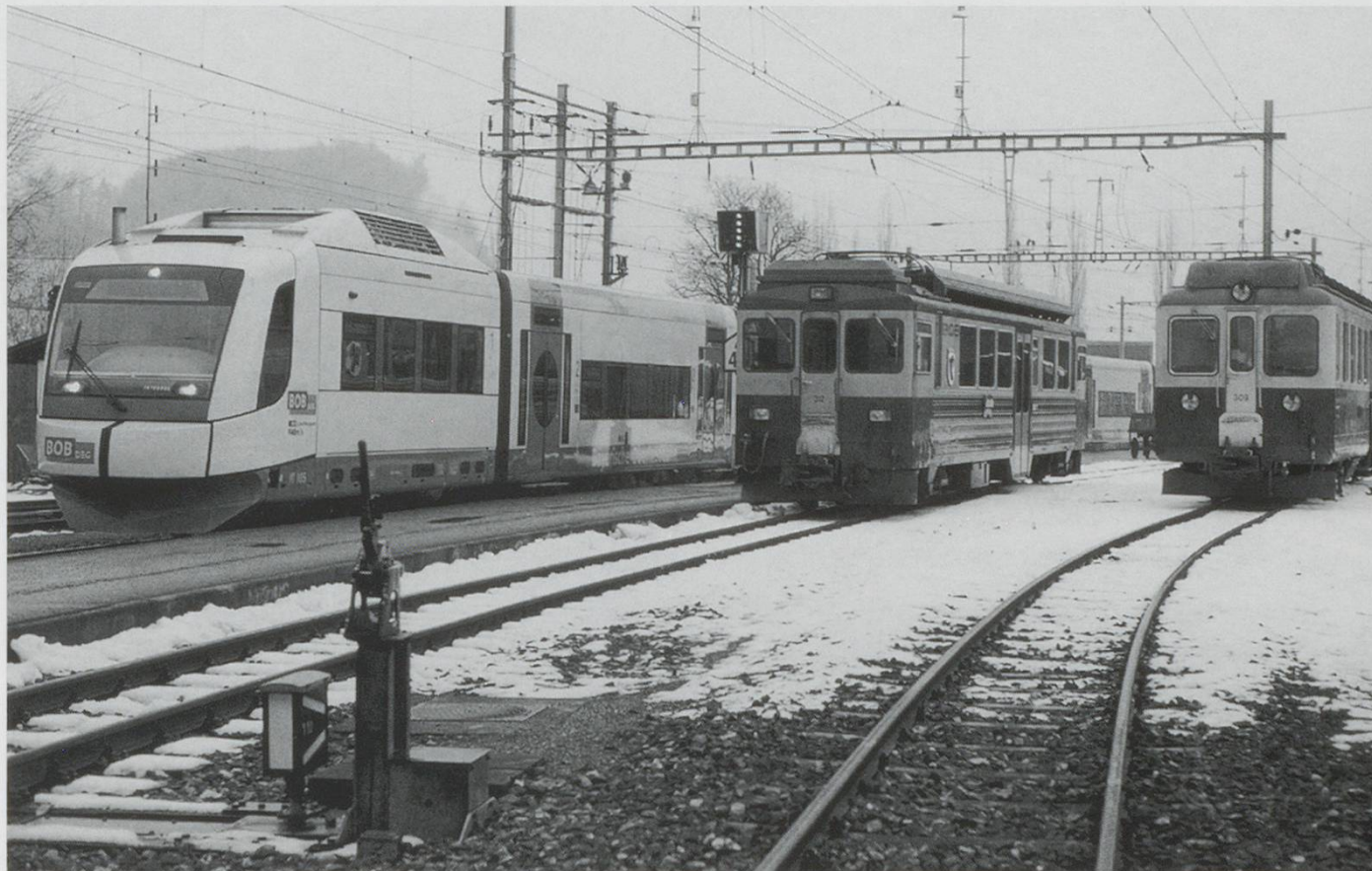
The two BOB's meet in Interlaken Ost. From left to right - BOB VT 105, BOB ABeh 4/4 312 and BOB ABeh 4/4 309. 10th Jan. 2000.