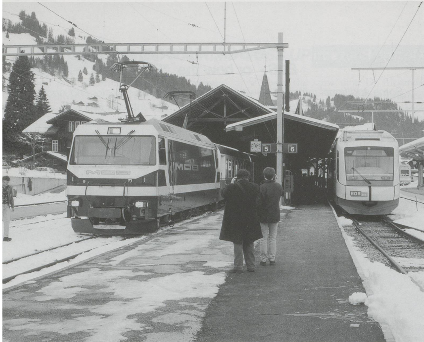
The "BOB" meets the MOB in Zweisimmen. 9th Jan. 2000.