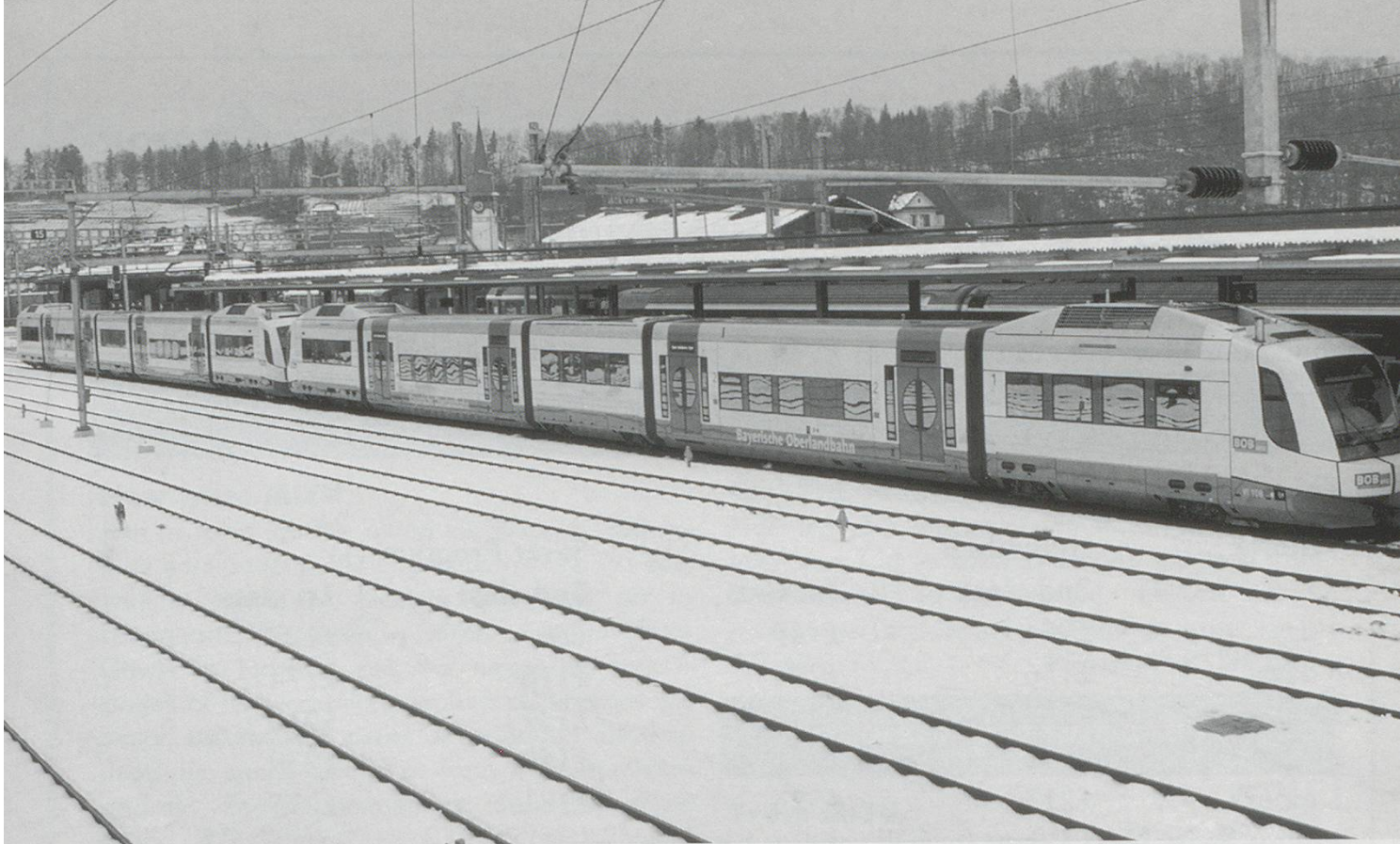
Two of the Bavarian Integral diesel units in Spiez, 360 foot long!