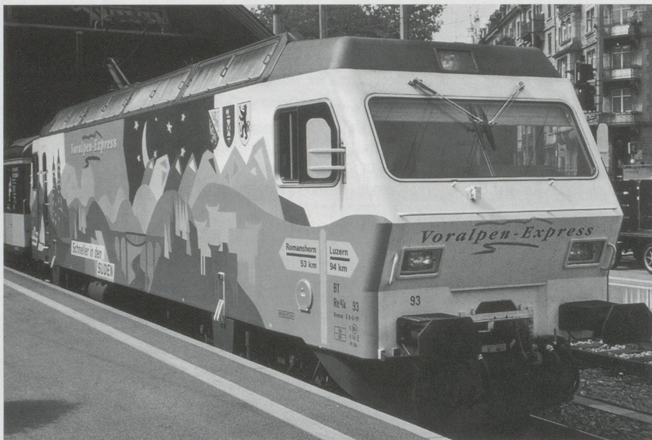
The Editor indulges himself again with a picture of his favourite loco, the BT Re 4/4. This time it's No.93 in the Voralpen livery. Give me the BT green and cream any day, and have you seen the cow livery? Ugh! Anyway No. 93 stands at St Gallen awaiting departure for Romanshorn in August '99

For our 1999 Summer holiday we stayed near Luzern as a change from our usual venue, the Lake of Thun. Although not exactly a radical move, we were just on the edge of Luzern in the excellent Hotel Seeburg and this new location gave us a different perspective on things and enabled us to visit an area of Switzerland hitherto only available as a long day out from the Bernese Oberland