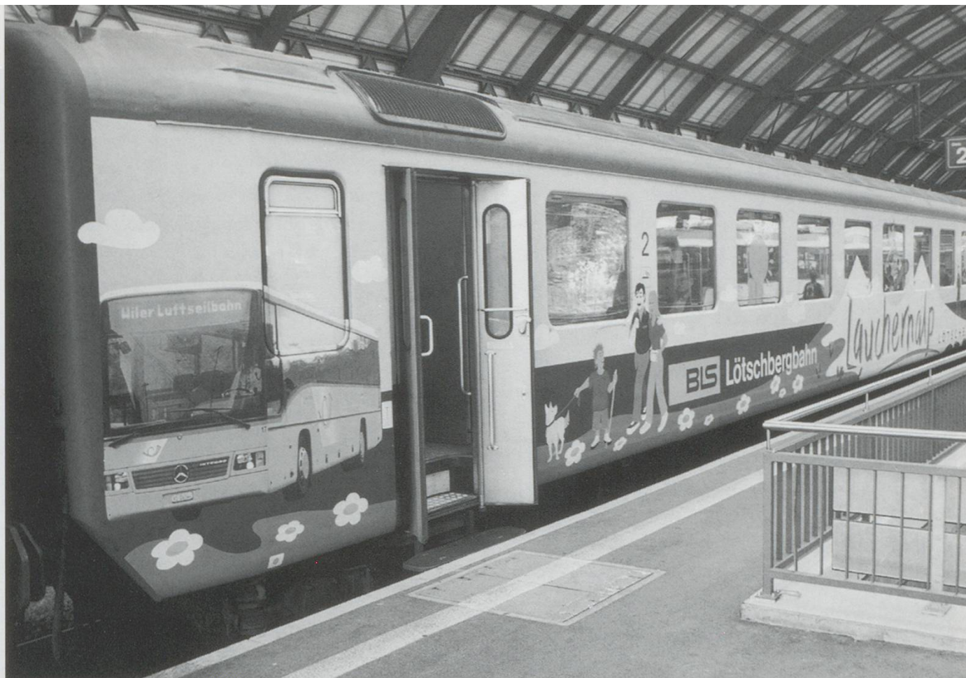
Pictured at St Gallen is a very colourful, or at least it looks colourful, BLS coach on a Zürich working and then probably to Interlaken. August 1999. No doubt someone will tell us the significance of the livery in time for the June issue, please!