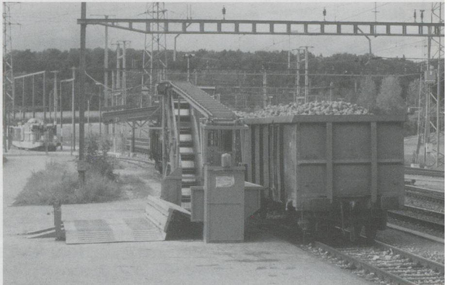
Two views of Hendschiken. The upper shows beet loading. In the background distance is the Zürich-Aarau line crossing the Brugg line. The latter (looking south) shows the station area, an Re6/6 and an Re4/4 travel light engine somewhere! Photos and diagram: Ernie Brack