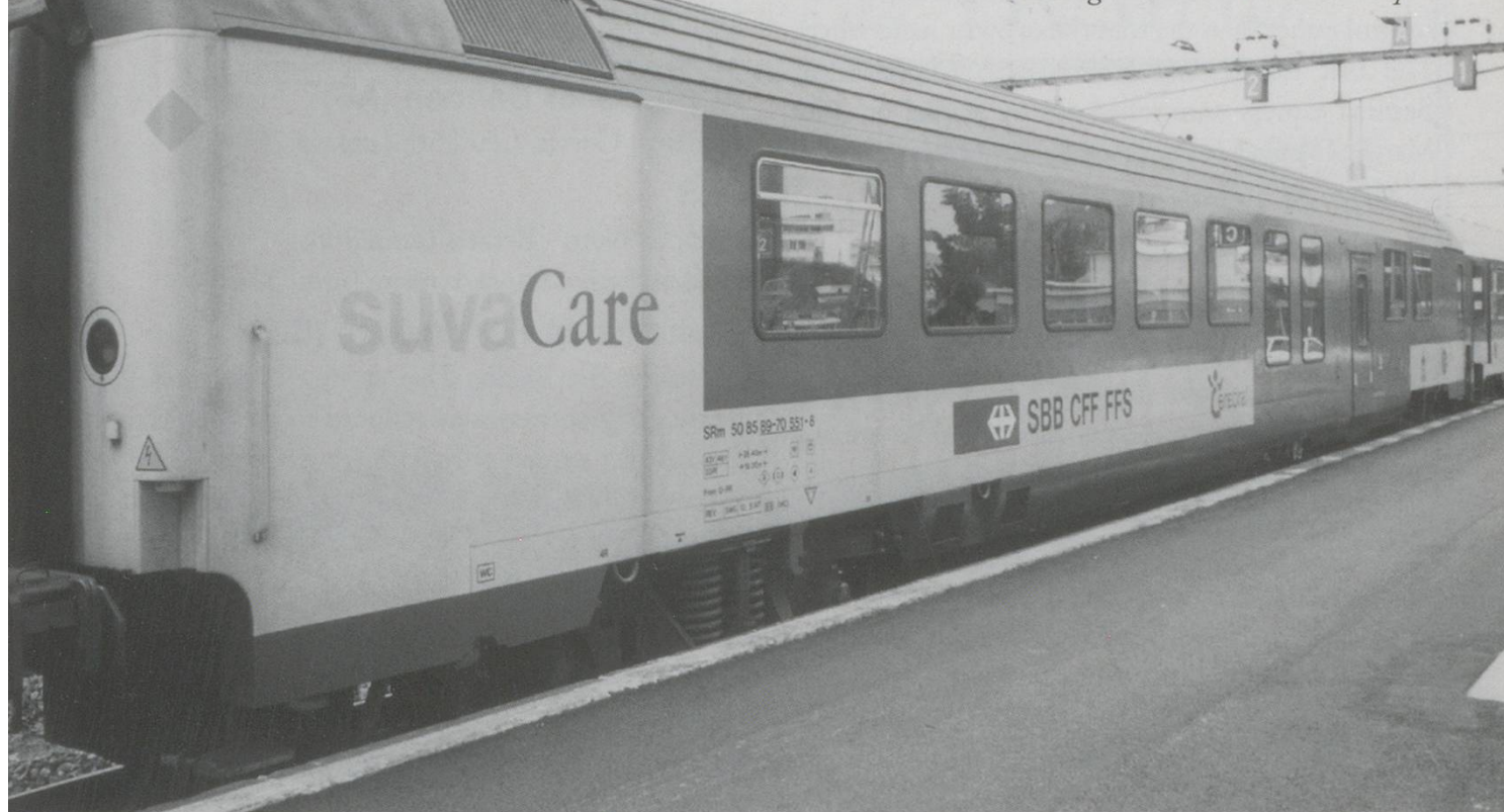
Mobility impaired group Coach at Thun - June 1999. Formed as part of the "EC" train "Matterhorn" to Brig.

The following infrastructure changes to the VAE route are planned: