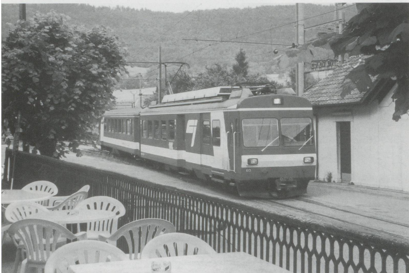
Chemins de Fer du Jura BDe 4/4 1 613 arrives at Glovelier 8/2000. Looks like an excellent place to wait for trains. You don't even have to leave your seat or glass.

During a 1999 trip I made a day-long 'safari' from Interlaken via the RM(EBT) from Thun to Solothurn, thence via the threatened RM route to Moutiers and on to Tavannes to join the Chemin de Fer du Jura (Tables 236 & 237). My interest in the network had been stimulated by the 'Private Railways' entry in 'Swiss Express' Vol. 4/8 December 1995 and by a rumour that part of the network may be under threat. On that occasion time permitted only a single trip from Tavannes to La Chaux de Fonds (changing at Le Noirmont) but the landscapes of the Jura - so different from the High Alps - were so attractive that I resolved to visit the Le Noirmont-Glovelier branch at the earliest opportunity. Operational interest was roused by the approach to La Chaux-de-Fonds where the train suddenly plunged onto the main road into town from the rural simplicity of the station at La Chaux-de-Fonds-Est and scuttled down the street with a tail of cars before abruptly angling across the road and diving down into the station shared with the SBB, and where the single car of the CMN service for Les