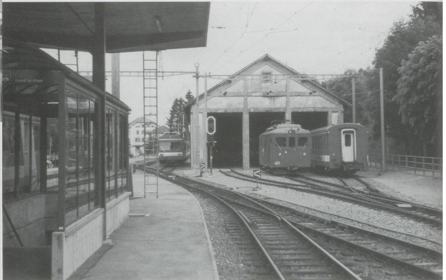
Chemins de Fer du Jura. Saignelégier depot 8/200. L-R. Bde 4/4 n 611, De 4/4 401 and trailer 754.

shoulder of the ridge ahead. I could only assume the points were of the usual narrow gauge spring-loaded variety permanently set for unidirectional travel. Having climbed above the tree line and executed a 180° turn, the line entered another steep-sided combe with frequent curvature and a series of short tunnels and arches through rock outcrops and all the time following the south-facing slope of a wooded valley. A stop at Bollement, deep in the woods, produced no passengers but the heartening sight of a track gang at work and the encouragement of seeing a series of neatly-stacked bundles of metal sleepers, presumably for imminent relaying. Continuous close growing pine woods produced a depressing atmosphere with little relief until at Pré-Petitjean we