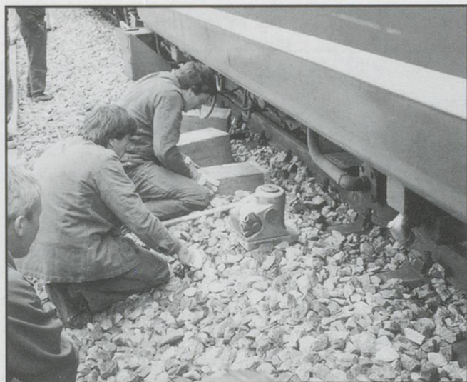
The maintenance gang get to work.

Further observation was cut short by the arrival of our relief train being pushed up the track by an old motor coach. Now the fun began as all the passengers had to transfer to the relief. No easy job in that everyone had to walk along the retaining wall past the maintenance gang, over the various crow bars, jacks and tools and make their way up the steps onto the train. This was not helped by the fact that