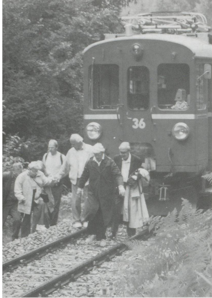
Passengers make a precarious walk along the track towards "relief".

Our walk now took on the form of a quick hike up the road to Preda. Hardly any traffic was moving, nothing passing us on our walk to Naz and on to Preda. The snow here was very thick, and walking