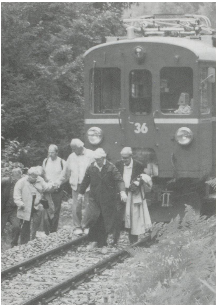
Passengers make a precarious walk along the track towards "relief".

Our walk now took on the form of a quick hike up the road to Preda. Hardly any traffic was moving, nothing passing us on our walk to Naz and on to Preda. The snow here was very thick, and walking