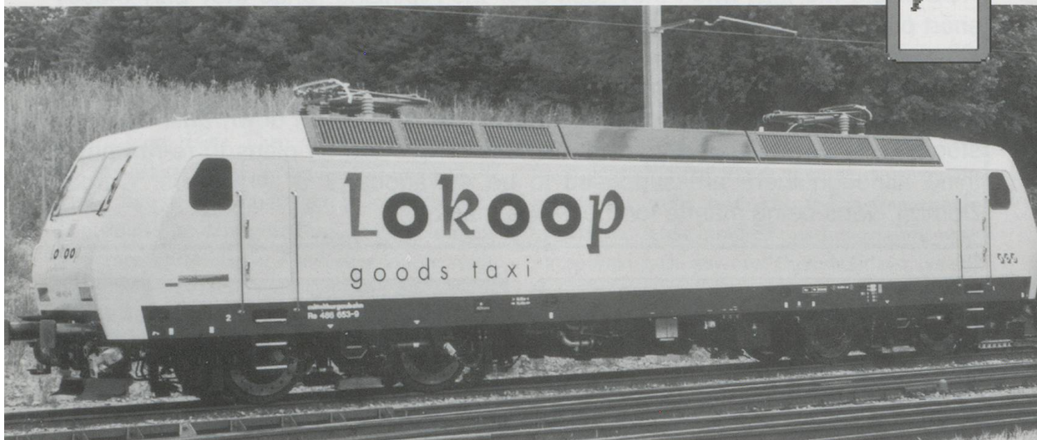
Lokoop's 486 653-9 parked at Kreuzlingen. 1/7/2000. See MthB below.