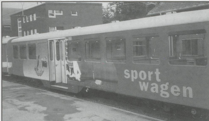
Furka Oberalp Sportwagen B4241 formed in the 0839 Brig-Disentis at Andermatt. 23/6/200.

Bus - rail interchanges have been provided at both Altstätten and Heerbrugg, adjacent to the S-Bahn terminal track.