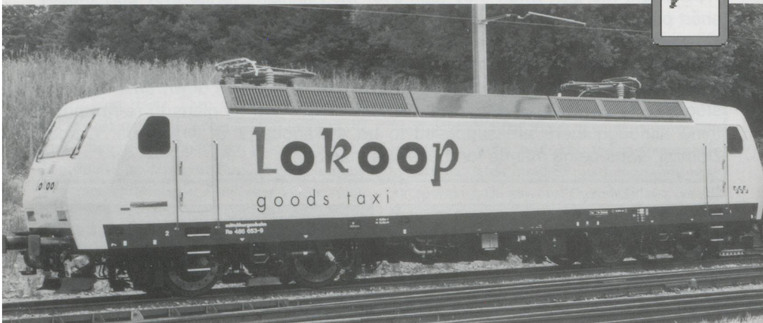
Lokoop's 486 653-9 parked at Kreuzlingen. 1/7/2000. See MthB below.