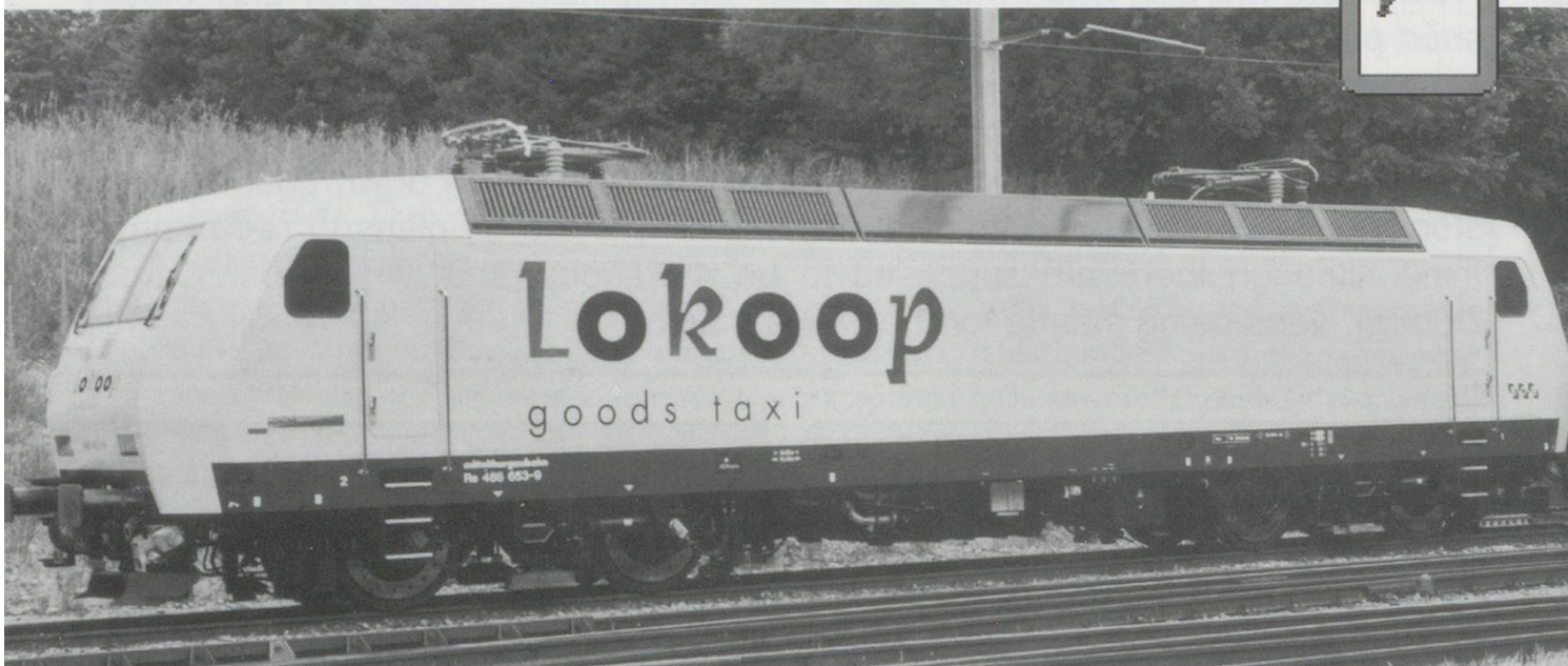
Lokoop's 486 653-9 parked at Kreuzlingen. 1/7/2000. See MthB below.