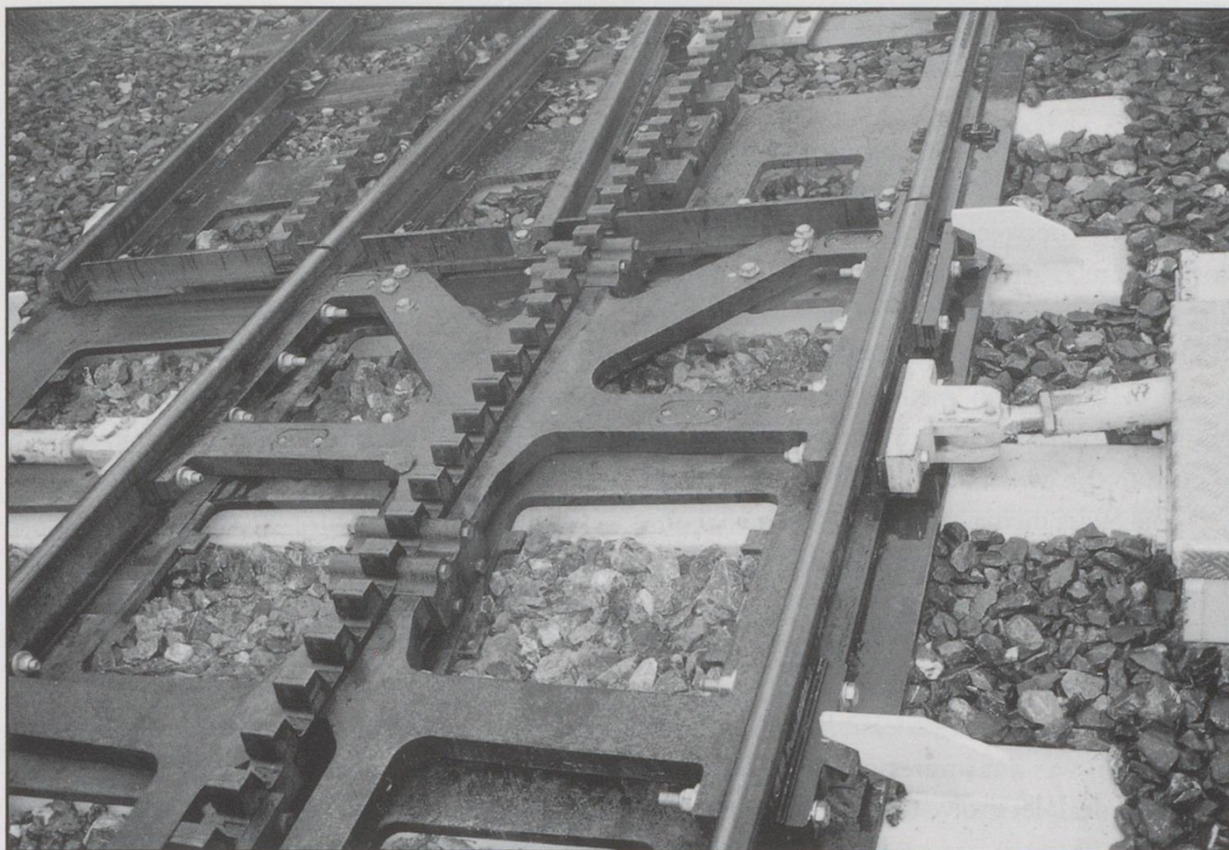
The actual ends of the turnout in detail, the track really is straight through. To the left the diverging track can be seen partially intertwined with the straight route.

on. A special base for the track and rack was constructed, consisting of squares that have a slit at one end. These slits, when pushed closed, will bend the track components situated at the opposite side of the square. The problem of expansion was solved by inserting a second base fixed at the opposite end from the track ends and would thus expand in the opposite direction as the track itself, in other words the opposite expansions cancel each other out. Of course this is a greatly simplified description of the actual workings! Finally, after more than ten years of work, a fully working prototype turnout for the standard gauge Rigi Railways was installed at Rigi-First station below the summit on the 30th September 1999.