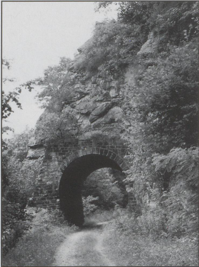
A short tunnel through a rock outcrop near Mesocco.

Until a few years ago, there were still some catenary masts in place, but even these have gone. There is another Postbus stop at Sorte, although the village is across the river, then comes Cama, where the rails now start.