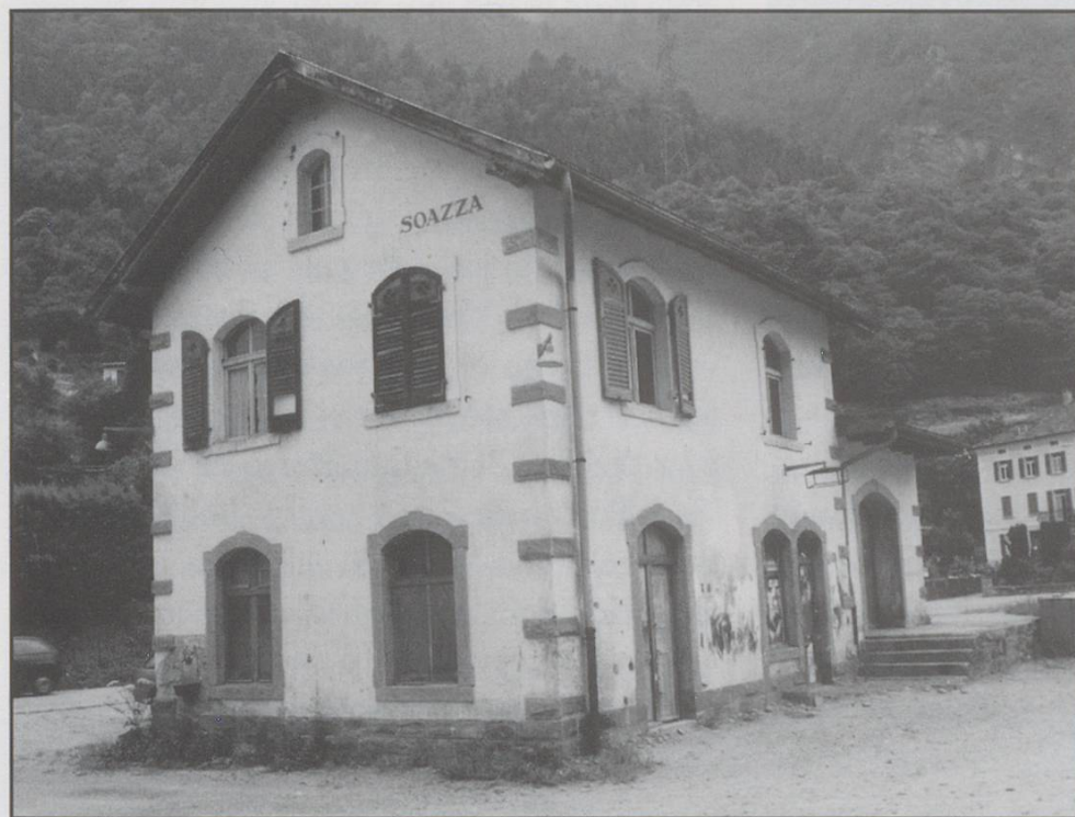
The station building at Soazza. Although slightly different in size and style from Mesocco, the door and window stonework are the same. This view is looking towards Mesocco, the tracks running to the right of the building

Rather than follow the road, I followed a path along the river bank to Cabbio, the next