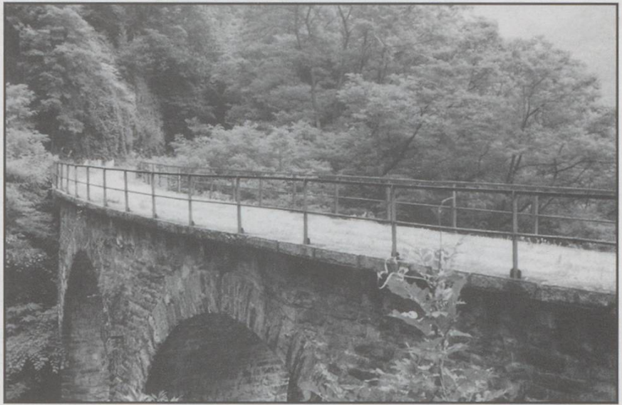
From Mesocco to Soazza the line winds along the mountainside through thick woods. This bridge spans a stream, viewed towards Mesocco. The handrails, although rusted, are still sound.

closer to the old main road, both vertically and horizontally, until it joins the road and all