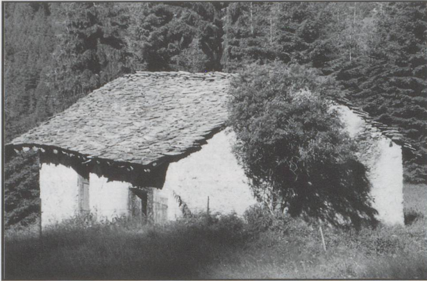
Fairly typical of the farmers buildings tucked away in odd corners of the landscape. This one is just below Soazza

the river. Just how old this bridge is I do not know, although the name possibly gives a clue. It is certainly not neglected, despite its obscure location. After this, the route on to Pian San Giacomo is through woods and straightforward, and ends by crossing the river again over a somewhat more modern bridge that leads directly to the Postbus stop outside a restaurant (which was put to good use).