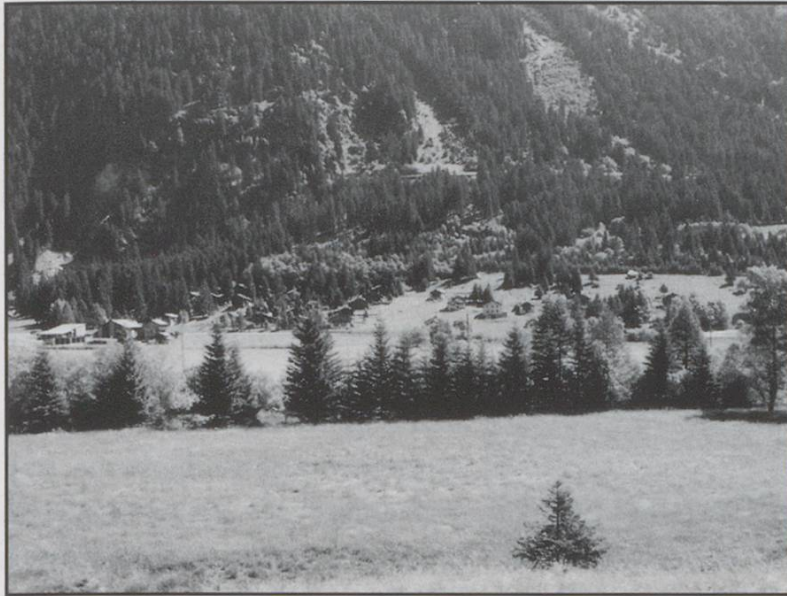
The northern outskirts of Pian San Giacomo

copies of part of the routing. The station at Mesocco lies at 769 metres above sea level while the community of San Bernardino is about 1630 metres. To overcome this difference in altitude would have involved some impressive engineering, including 10 tunnels and several crossings of the river Moesa. Only one intermediate station seems to have been planned, at Pian San Giacomo, although others might have been built, as the proposed routing passed close to settlements at Logiano, Darba and Andergia. In the end, lack of Federal support and financial constraints caused the shelving of the project in the 1930s and it was never resurrected. However, the routing of the new road, built after WW2, bears a number of similarities to that of the proposed railway. A more detailed description of the proposed railway was printed in Mikes' article in "Swiss Express" vol.3, no.3 (September 1991).