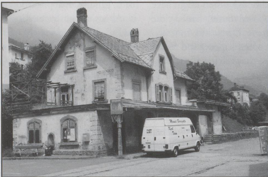
Mesocco station. Trains arrived from the left and, had the line been continued, would have started to climb almost immediately on leaving the station. Faintly visible on the end wall, centred under the top two windows, is the original painted station name

that was once occupied by the approach tracks. The station building is still there, with both the original and later lettering of the station name visible on the end wall. Although the building is disused, it is far from derelict, and it is possible to ascertain that the doors and window