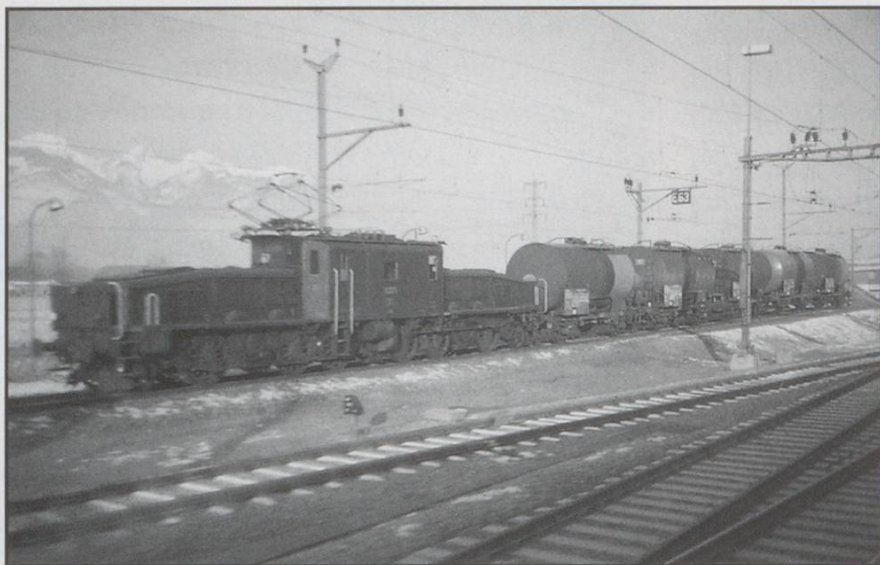
Tucked away in Lausanne depot on Christmas Day but active again two days later, Crocodile 14275 is seen shunting tank wagons at the oil depot at St Triphon, 27/12/79.

Please bear in mind that these were taken with schoolboy equipment many years ago!