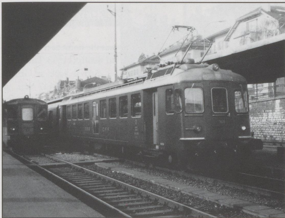
SBB RBe 4/4 1405 at Neuchâtel. 25/12/79

Presumably worried about the amount of time I had to spare, what with having to climb back up to the station, I went only as far as Serrières, where I boarded tram 1104 for the return journey. I must have felt lazy, because I note that I took trolleybus 35 on route 7 to get back to the station, and that it derailed on the