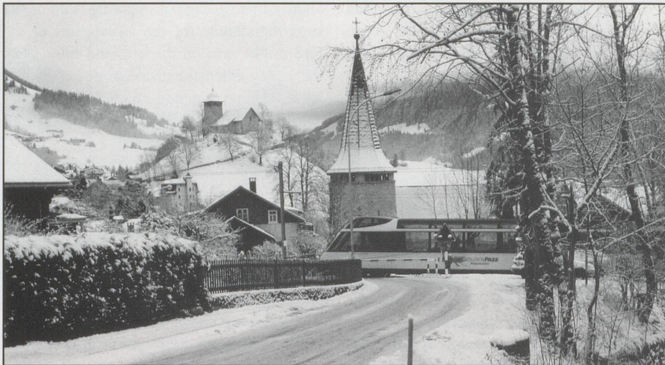
The level crossing at Château-d'Oex. January 2003.