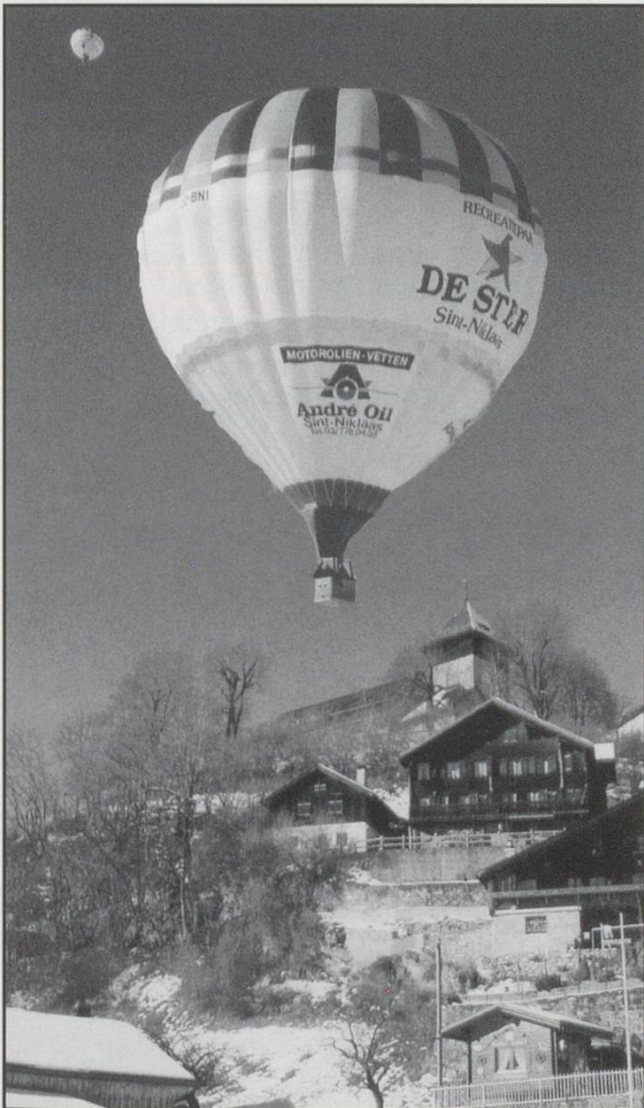
A balloon above Château-d'Oex.

The 26th Festival will be from 24th January to 1st February 2004. Take a rail trip to Chateaux d'Oex and you could join in the spectacle and fun and possibly take a different form of transport in Switzerland.