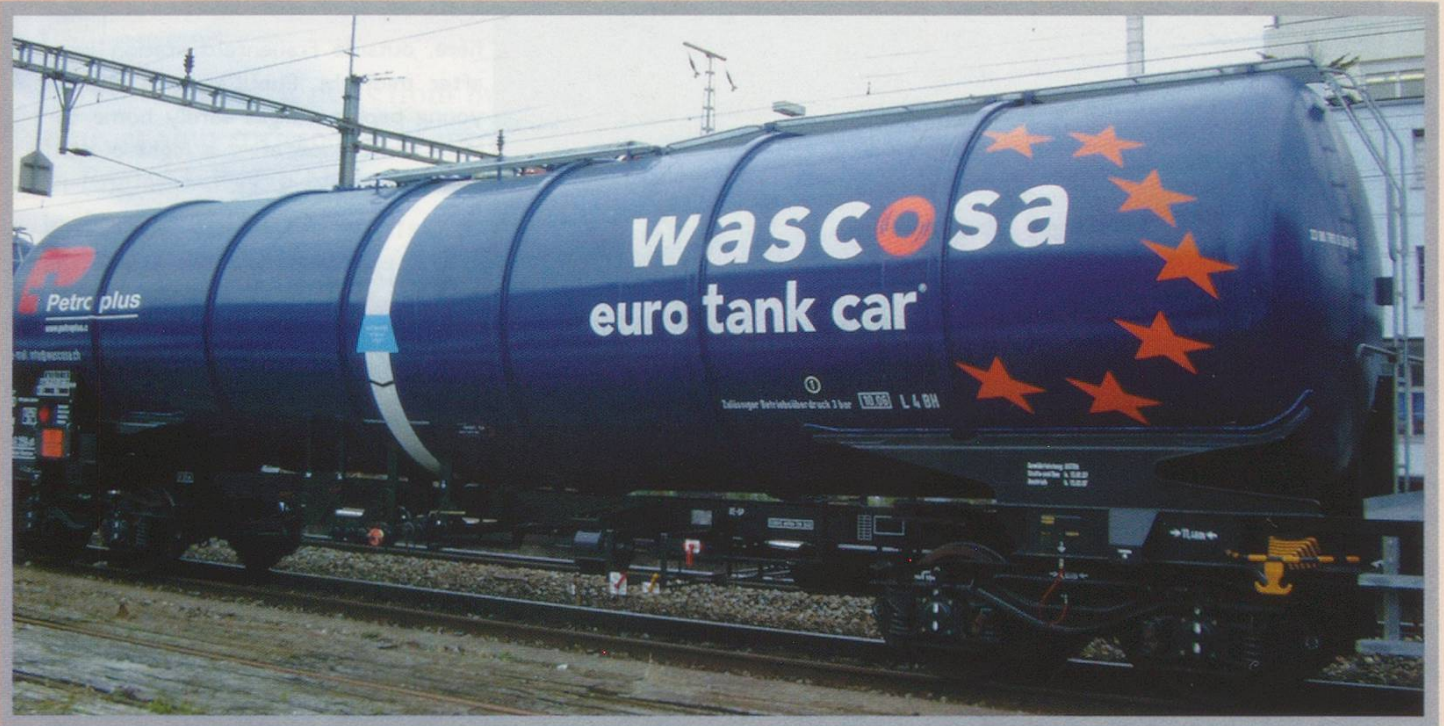
One of the new colourful euro tank cars at Glattbrugg, the fuel depot of the Airport of Zürich.

Back to railways in Switzerland. You might have noticed I have a special interest in the BLS. After all, its main line runs right at the back of my house! Also, I am very interested in freight. So what better than some news that combines both. The deregulation of the railways in Europe brings sweeping changes in the way goods are transported on the railways. To the shipper, overall costs and depending on the commodity, speed, now decide the means of transport chosen. The railway industry used to have a bewildering array of wagons, a different one for every commodity, at its disposal. The cost of maintaining such a very specialised, but only lightly utilised fleet of cars, has become uneconomical. With ever increasing safety regulations, as well as the increasingly more complicated insurance and legal considerations, the number of different wagons has to be reduced.