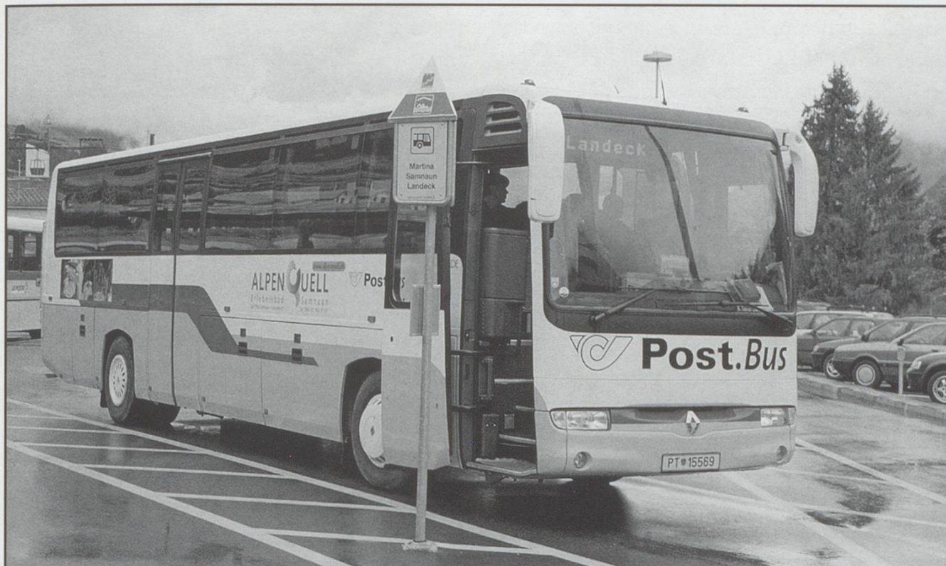
An Austrian Postal bus waits departure at Scuol-Tarasp for Landeck. Probably a Renault integral, the Austrian PTT operate some eccentric vehicles, having just purchased a very large number of Temsa coaches from Turkey. 06/03

cided to return via the Albula I took a Scuol-St Moritz train stopping at Samedan and changed there for the Albula line. From Chur I took an SBB Inter-Regio train to Sargans and taking the usual ÖBB EC165 international train returned to Innsbruck, Austria.