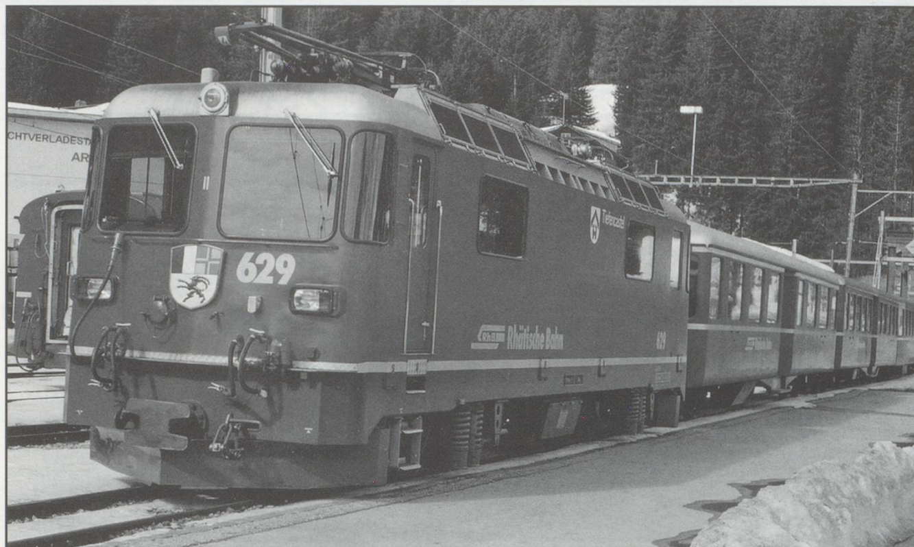
RhB Ge4/4 II at Arosa 09/03/03. Note the first class centre-entrance coach behind the locomotive.