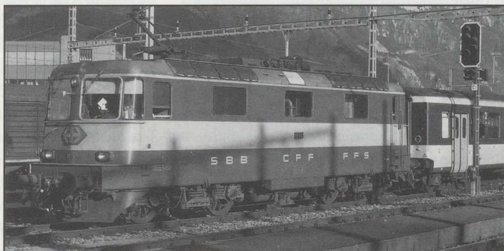
Re 4/4 II 11109 rests at Sargans displaying its TEE livery. 09/03/03.

Before leaving for Austria I bought two Eurodomino rail passes, one for the ÖBB railway network (valid for 5 days) and the other for the Swiss Railway network (valid for 3 days). To the best of my knowledge there is no specialist railway travel office in Greece offering any of the Swiss travel tickets. The Eurodomino railpass, which is only available from the Greek State Railways, and is only valid for some railways, is very convenient. To travel into Switzerland I use both Eurodomino