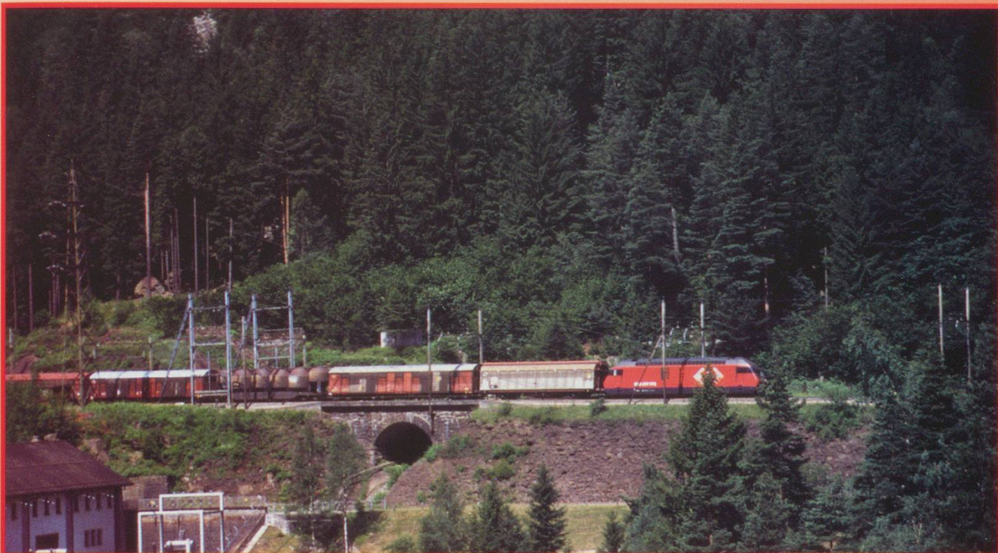
ABOVE: A northbound freight, hauled by a single Re 460, passes the power station at Pfaffensprung, between Gurtellen and Wassen. At this point, the railway and motorway are at the same height, but on opposite sides of the river. This shot was taken from the path that runs on top of the motorway avalanche shelter. The same motorway has proved both a blessing and a curse – in this case it is a blessing, as the path follows almost entirely the gradient of the road and gives good views of the railway. Access to the path, which runs from Wassen to Gurtellen, is at each end and also at Pfaffensprung.