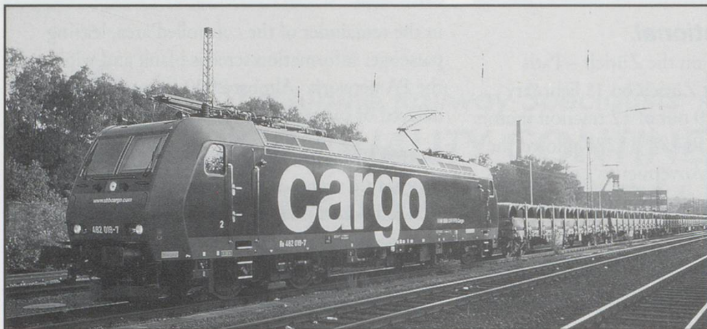
The first through freight train between Saarland and Italy, carrying steel-what else? See Notepad/International for more information.