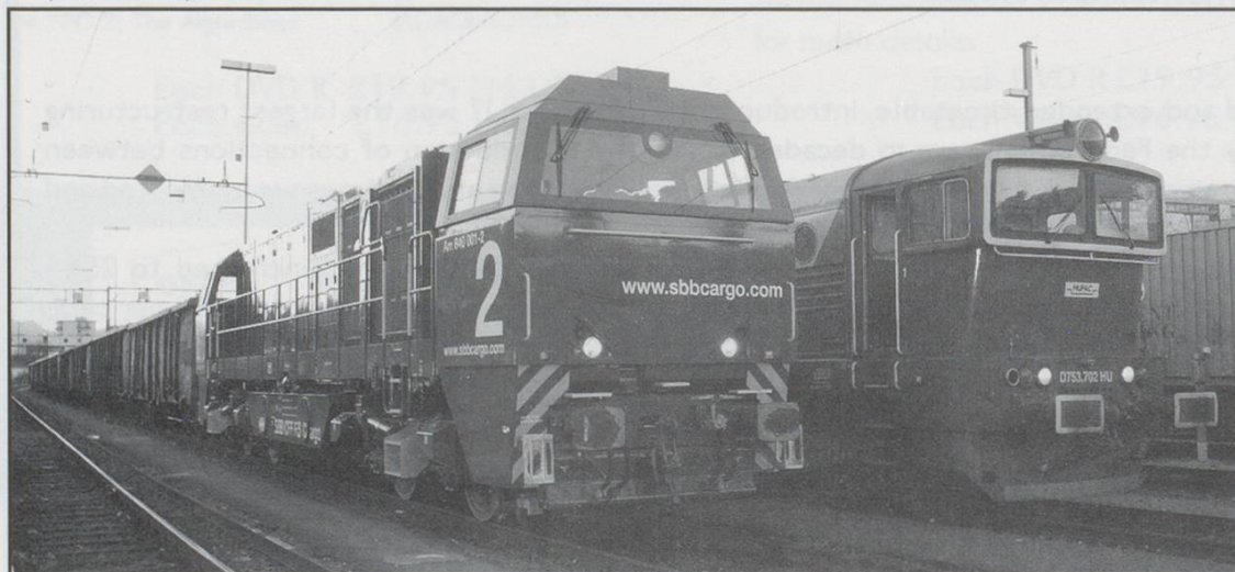
An SBB Am 840 belonging to the SBB Cargotia subsidiary is pictured at Chiasso alongside an ex Czech Hupac locomotive, illustrating the integration in services taking place all over Europe.