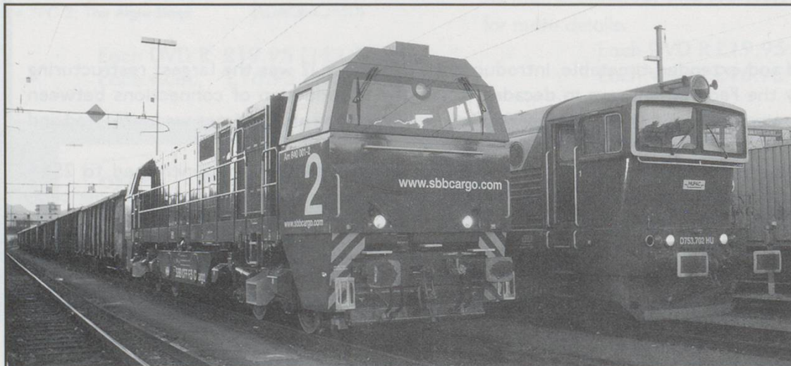
An SBB Am 840 belonging to the SBB Cargotalia subsidiary is pictured at Chiasso alongside an ex Czech Hupac locomotive, illustrating the integration in services taking place all over Europe.