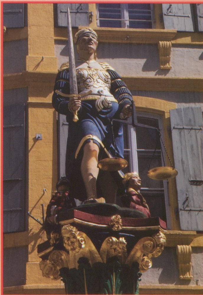
ABOVE: La Fontaine du Justice. BELOW: Looking up from the lakeside

As you follow the route you will become aware of the classic French influence in the 18th century style architecture that surrounds the statued fountains so typical of towns and cities in Switzerland. One of the most notable of these is the Fountain de la Justice from the mid 1500s. The walk passes through the Hôtel de Ville with a model on display of the town as it was in the 18th century. Just to the north of the market square and the old covered market is the Corbets Passage with exterior stone spiral staircases reminiscent of those found in Lyon, France. The wide market square of Place des Halles with the 16th century pinnacled market hall opens out onto the lake. The walk now takes you up hill to the Château, which dates back to the 12th century. There's much to take in around the Château including the Collégiale Church. From the grounds there is a good view of the railway line west of the station and if you know the times of the services you will see a selection of trains including the TGV. You'll need a telephoto lens for the camera though, to get the best shots. Proceeding downhill you will pass the medieval stone tower prison