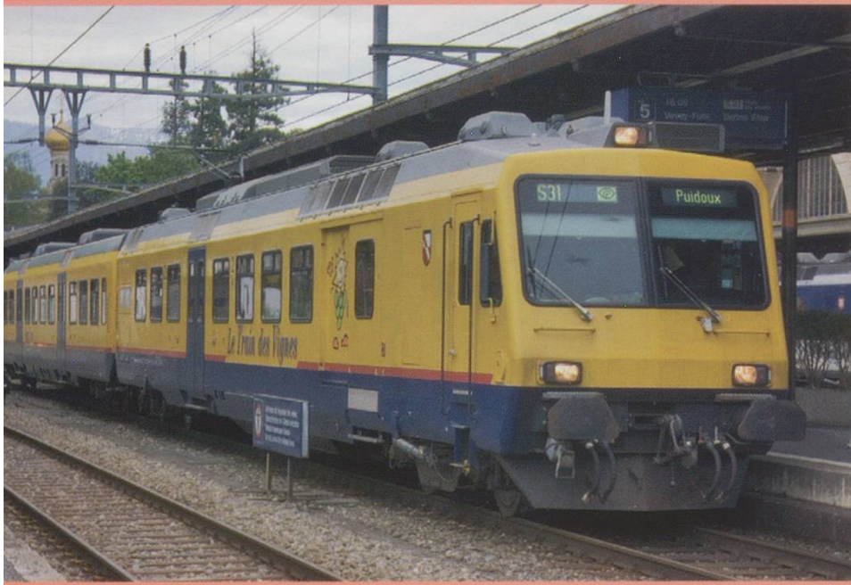
TOP: Le Train des Vignes leaves Vevey for Puidoux. It's a very pretty ride through the vineyards. 06.05.05 CENTRE: A view of Vevey station showing both Le Train des Vignes and an MOB train for Blonay.