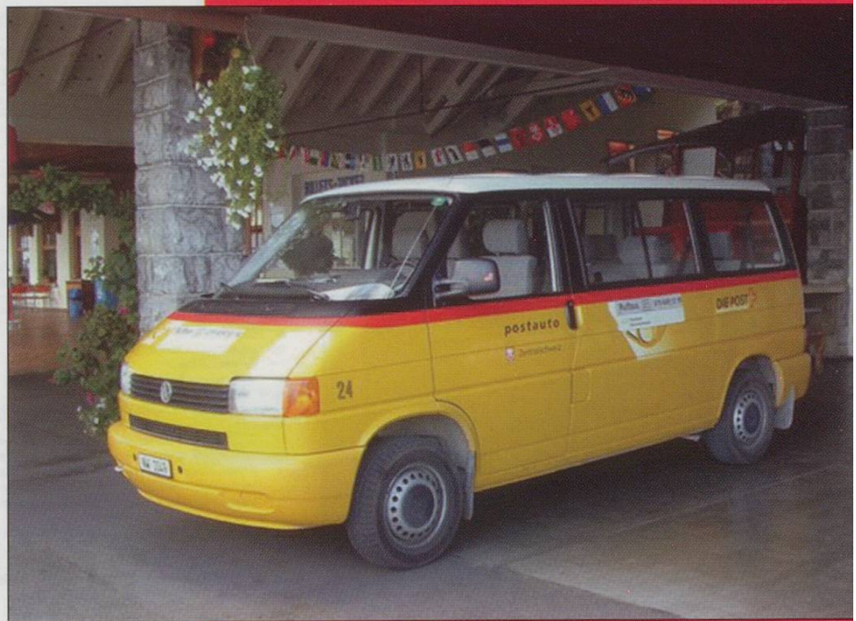
The local PostAuto at the lakeside.