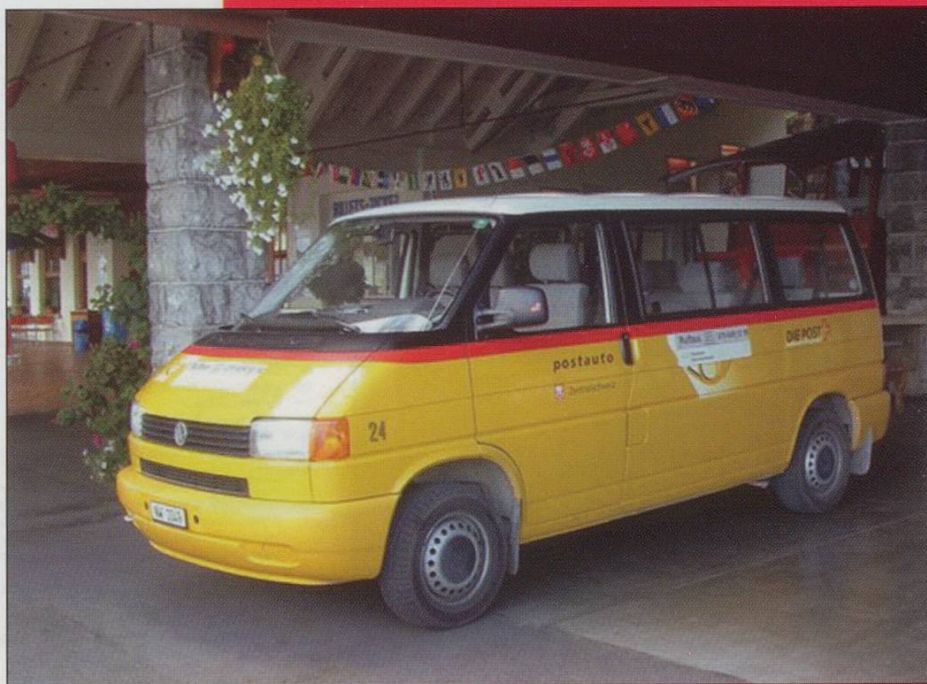
The local PostAuto at the lakeside.