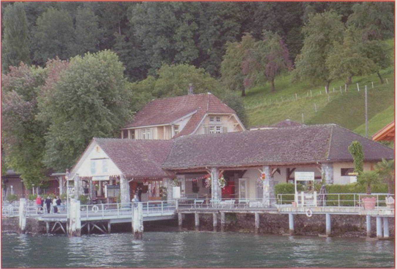
Kehrsiten-Bürgenstock lakeside station.