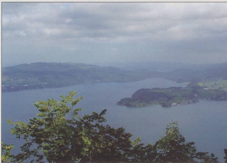
The view from the top.

In 1990 another major refurbishment was announced at a cost of 2.4 million Swiss francs. This provided a new base station plus a specially equipped panorama car, glazed on three sides. When the lift reopened in April 1992 the maximum capacity was still twelve passengers but state-of-the-art technology ensured a smooth ride whatever the load. At the same time the path from the Bürgenstock hotels was greatly improved. I imagine that it would be possible to push a wheelchair all the way to the lift, though it might be a hard job on some of the steeper slopes!