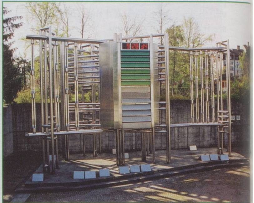
TOP: The Carillon at the Musée International d'Hologerie, La Chaux-de-Fonds.