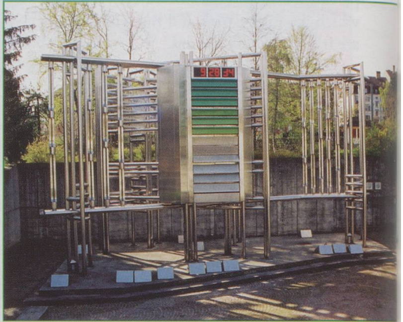
TOP: The Carillon at the Musée International d'Hologerie, La Chaux-de-Fonds.