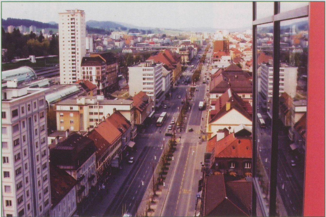
Looking along the Avenue Lépold-Robert from the Tour Espacité, La Chaux-de-Fonds.

The regular SBB service to La Chaux-de-Fonds climbs steadily out of Neuchâtel into the heart of the Juras. With a reversal at Chambrélien the route passes through a 3259 metre tunnel not far short of La Chaux-de-Fonds. The town is at the head of the valley to La Loc and on into France. Many of the world famous Swiss watch companies have their factories located between the towns.