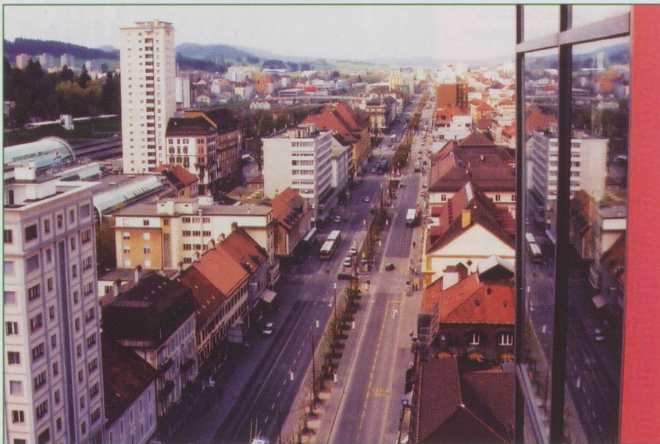
Looking along the Avenue Lèpold-Robert from the Tour Espacité, La Chaux-de-Fonds.

The regular SBB service to La Chaux-de-Fonds climbs steadily out of Neuchâtel into the heart of the Juras. With a reversal at Chambrelieu the route passes through a 3259 metre tunnel not far short of La Chaux-de-Fonds. The town is at the head of the valley to La Loc and on into France. Many of the world famous Swiss watch companies have their factories located between the towns.