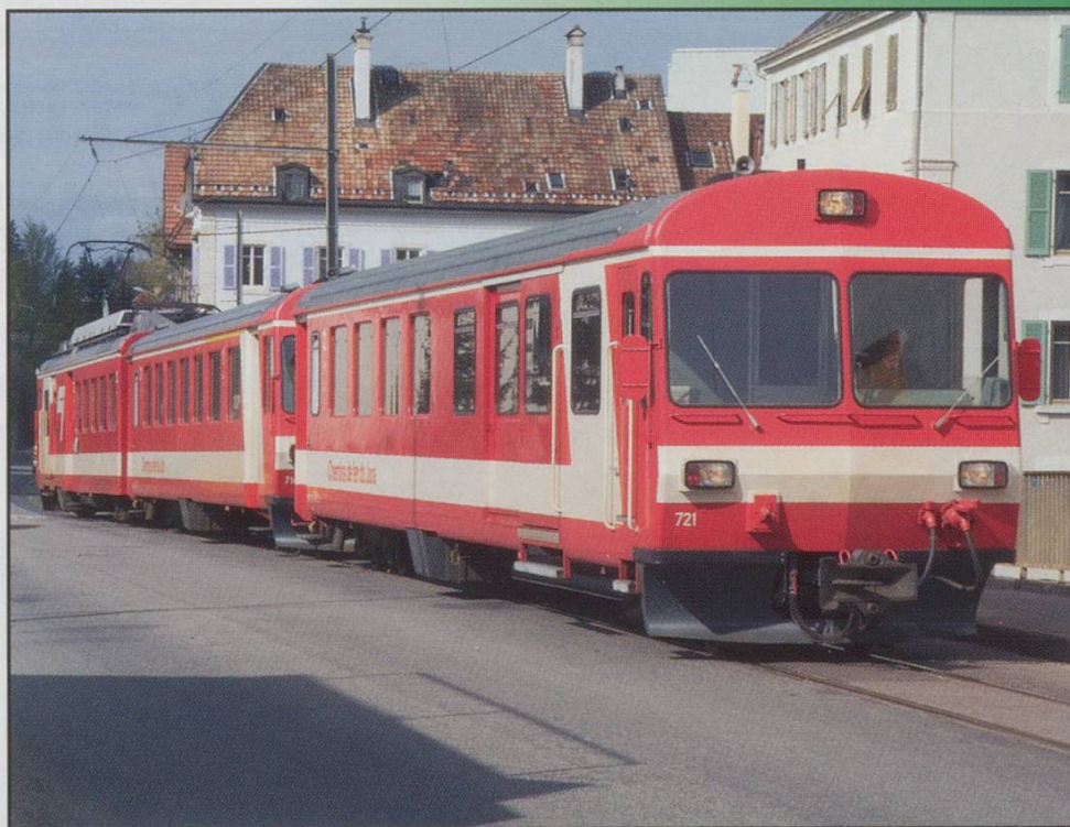
TOP: Fontaine Monumentale, La Chaux-de-Fonds