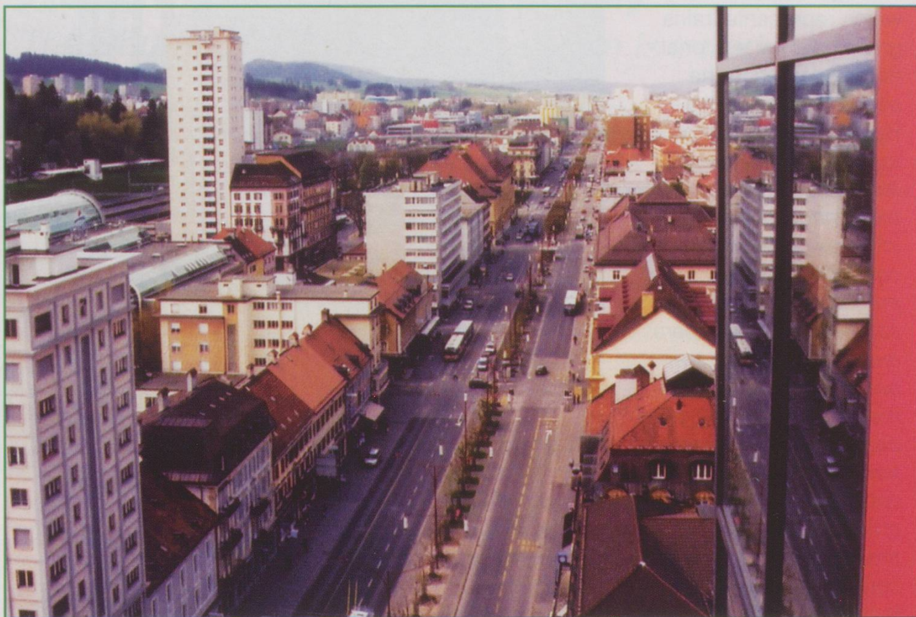
Looking along the Avenue Lépold-Robert from the Tour Espacité, La Chaux-de-Fonds.

The regular SBB service to La Chaux-de-Fonds climbs steadily out of Neuchâtel into the heart of the Juras. With a reversal at Chambrélien the route passes through a 3259 metre tunnel not far short of La Chaux-de-Fonds. The town is at the head of the valley to La Loc and on into France. Many of the world famous Swiss watch companies have their factories located between the towns.