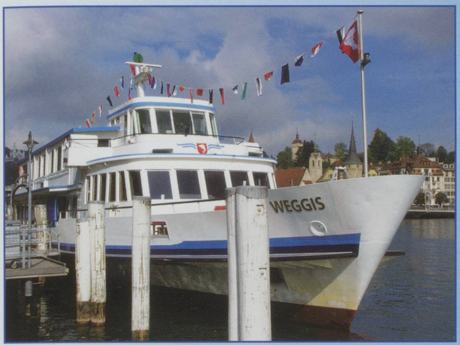
Motor Boat "Weggis" provided as the photo boat