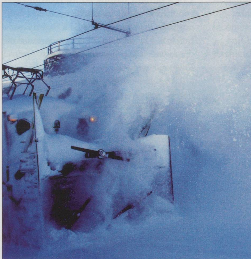
Due to the snowfall in the night, the first train is coming up with a snow blower in front. The cutting blades are clearly visible, churning up the snow below and blowing it away to the left. Note the twin pantographs: the Gornergrat Bahn was built using three phase current.

take the first train down to Zermatt to be able to attend the presentation of the new book on the Simplon Railway in Brig that morning. It was very early: the path down to the station had not yet been cleared. I had to plough through the two feet of snow – not very easy for me. Due to arthritis in the knees, I have to walk with a stick and I also will be 70 this year! Anyway, I got there. The first train came up