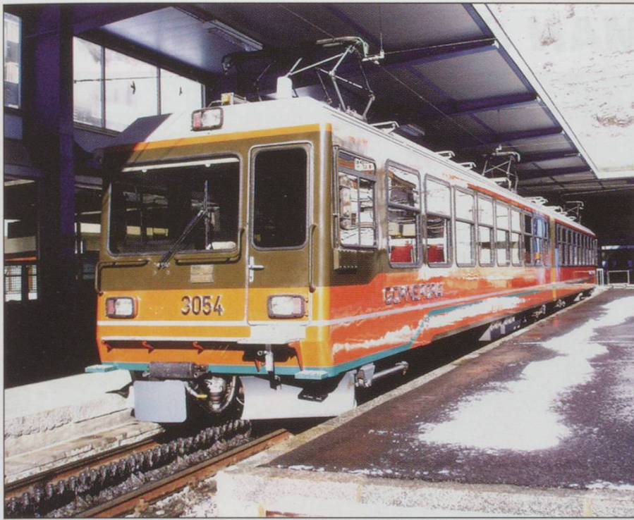
After arrival at Zermatt, the early morning sun was strong enough to have melted most the snow off the unit.