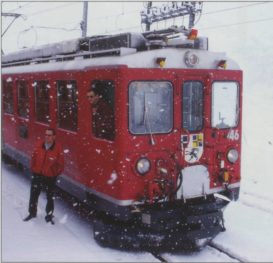
Sping Snow at Bernina Suot on 18/05/05. All Photos: Tony Bagwell.

be all digital, using my new toy a Minolta 7D digital SLR. This has three lenses, a 17-35mm wide angle, a 24-105mm standard and a 75-300mm telephoto. Being a digital camera the focal length of all these lenses gets multiplied by 1.5 because the digital sensor is smaller than a 35mm slide frame. Thus I could cover a range from 25mm to 450mm – this should be enough for most situations. With this high-resolution camera even a 1 gigabyte memory card would only hold about 150 shots, so some other form of storage was needed. Thus my laptop and card reader came on the trip too