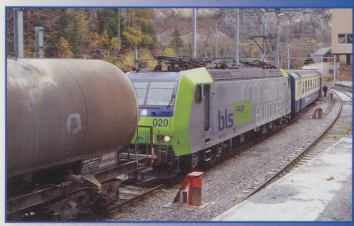
The charter train buffers up to wagons being loaded at the Blausee Mitholz quarry.

Designated 'Historic Locomotive' Ae4/4 251 pauses for the photo-stop at Erlenbach, enroute to Zweisimmen.