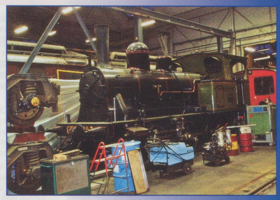
0-6-0T GTB No.3, resident of Spiez depot.

In conclusion Mercia Charters had organised a very enjoyable two days travelling using First Class coaching stock, complete with a buffet that stocked some excellent local beers. Although I had not been with the company before I would recommend them.