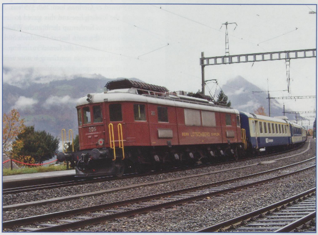
BLS celebrity loco Ae6/6 205 at the Leissigen photo-stop.

"Breaking the Ice" was the title that Mercia Charters gave to their first ever tour in Switzerland, based in Spiez in November 2005. Travelling out by air via Geneva a day early I had arranged B&B accommodation a short walk from Spiez station through the highly recommended myswitzerland.com website. On my spare day prior to the tour a trip to Interlaken behind BLS Re4/4 - 191, with a stop at Leissigen to photograph a SBB Ae6/6, enabled me to see the new liveries of both the Zentralbahn (formerly the Brünigbahn) and the BOB. A return to Spiez station after lunch not only allowed viewing of SBB Re4/4s and BLS 485s working on freights but also the passing of an intermodal train behind a pair of German 185s.