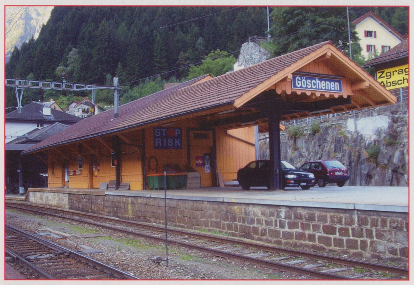
Goschenen freight shed. How much would it cost to dismantle this wooden building and re-assemble elsewhere?

Within Britain, considerable interest is shown in the preservation of vernacular buildings with museums, such as the Weald and Downland in West Sussex, established in order to promote further interest in the subject. As many readers will have observed during their travels in Switzerland, many regional variations in architecture are found within the country and the excellent Ballenberg Open-Air Museum fulfils a similar role to that of the Sussex museum, holding examples of traditional Swiss domestic and agricultural buildings (www.ballenberg.ch). Buildings, however, also derive from an industrial origin with those of a railway background falling into this category. In Britain some of those structures, which would otherwise have disappeared at the end of their operational lives, have been saved and have a 'second life' at one of the many preserved railways.