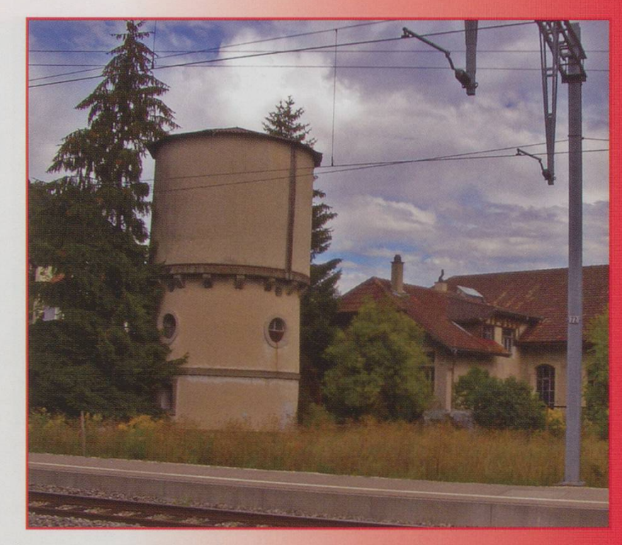
Moutier. The disused depot and water tower. What future do such buildings have?

Regular visitors to Switzerland will be aware of the continuing programme of improvements being carried out across the rail network, under the Rail 2000 banner. These works, although satisfying the indigenous population, the politicians and perhaps looking to a myriad of future European legislation, are themselves also helping to speed this process of change and many will probably have observed