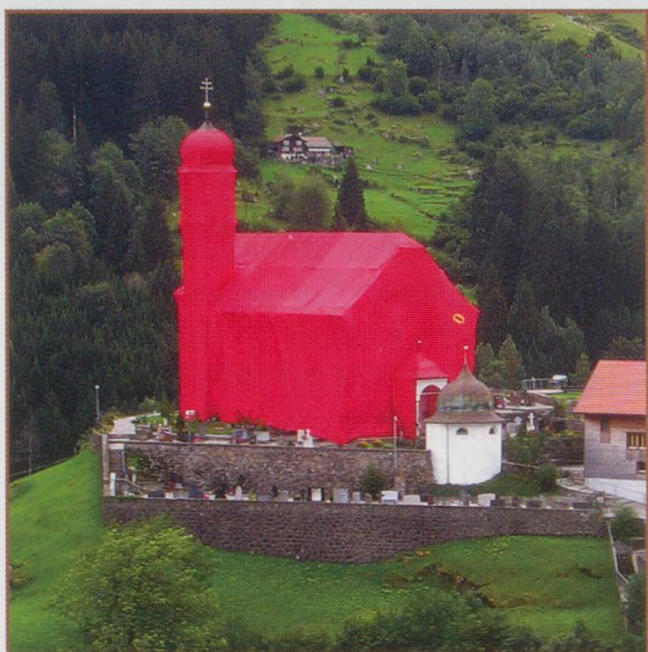
Wassen Church clothed in red to celebrate the 125th anniversary.