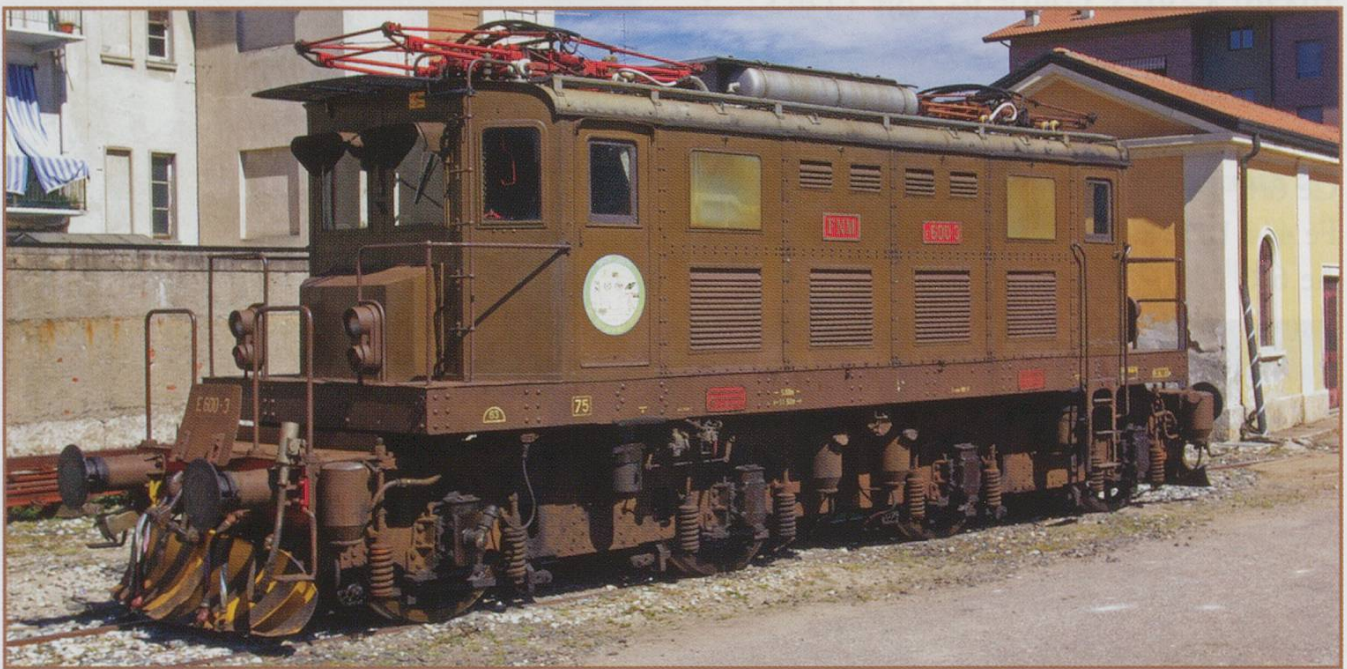
ABOVE: Italian ‘private’ company FNM Bo-Bo E600-3 at Luino.

An engineer’s vehicle fitted with a hydraulic lift platform was in use to give visitors a high-level view of the site.