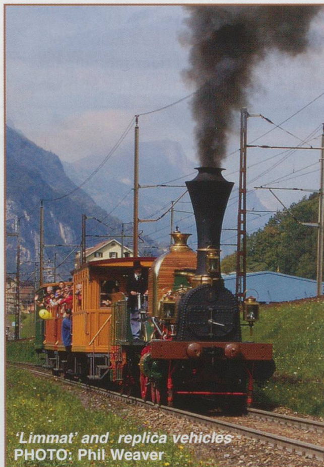
'Limmat' and replica vehicles

used for the display of rolling stock. A wooden walkway was built from the southern end of the island platform across the loops to the exhibition area, so visitors did not have the long walk between the station and the more usual depot entrance. This effectively reduced Erstfeld to a 2-track through station, with the outside of the island platform usable for the terminating local services from/to Zug.