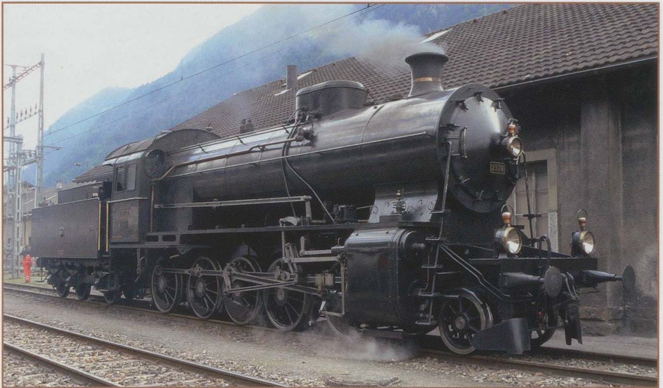
C 5/6 No 2978 simmers gently awaiting its next turn.