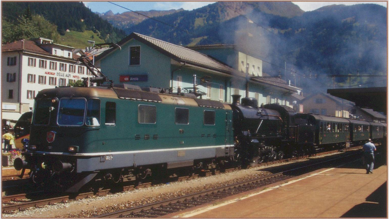
Re 4/4 ii 11161 and C5/6 2-10-02978 at Airolo priorto heading north into the Gotthard Tunnel.