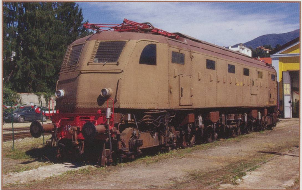
The Italian FS locomotive E428.208 at Luino.

Luino – A Sunday-only exhibition was located here reached by an hourly shuttle from Biasca worked by pairs of the new class 524 TILO "Flirt" units. Again, a mix of old and new provided plenty of interest. A variety of Italian electric locomotives included some of the current fleet (E402.154, E633.238, E636.284, E645.084, E655.162) and two of the old E428 2-D-2s (E428.174 & 208), while FNM Bo-Bo E600-3 was also present. On the turntable was Swiss Be 4/6 12339, while SBBC and Railion both showed examples of the locomotives used on their operations in Italy (E484.008, G2000.35 SF). Two elderly FS coaches, in need of some restoration work, were in a large shed while, just outside, was a FS Breuer-type tractor (ABL.4734). This was in working