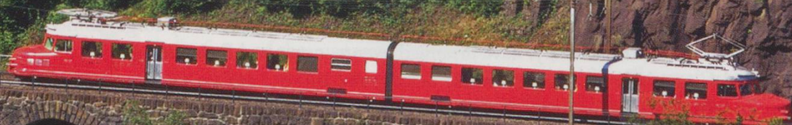
RAe 4/8 'Churchill Arrow' passing Hägrigen.