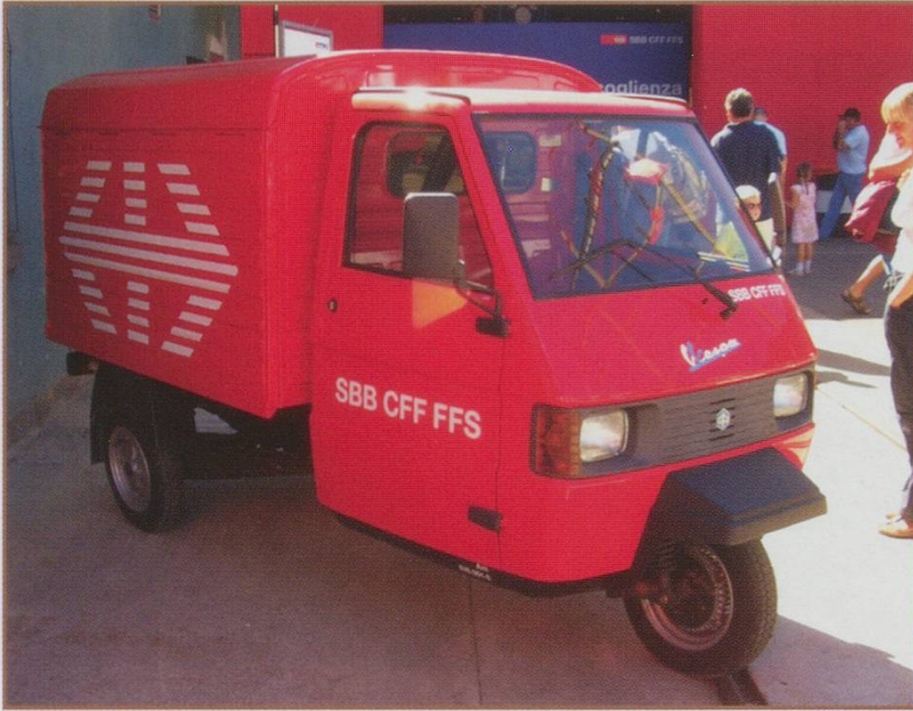
ABOVE: A Vespa delivery vehicle in SBB livery numbered Am 810 001-8 at Biasca.