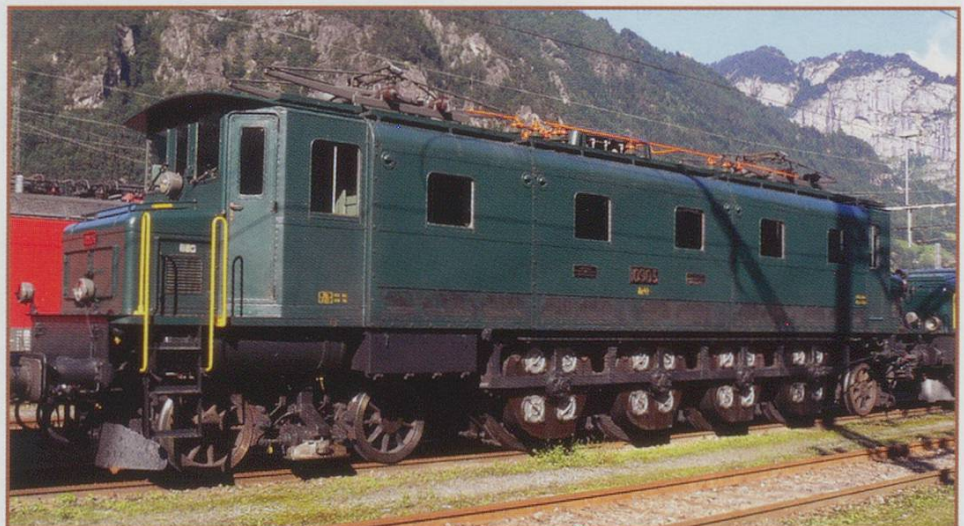
Ae 4/7 1095 at Erstfeld.

order, and shuttled along a short length of track every so often. Steam was represented by a FS 625 class 2-6-0 (inside cylinders, outside valve gear), but not in steam. Both of the German Pacifics worked specials from Bellinzona, possibly the first time that such locos had been to Italy, with the plan being for them to return Sunday evening double-headed. Sales stands were almost non-existent, but the station buffet was open and their food was excellent. The waiting room, a large and lofty area, had a stage erected at one end and was decorated with Italian flags - very impressive. No walkways here - everyone just walked across the tracks. When there was a train