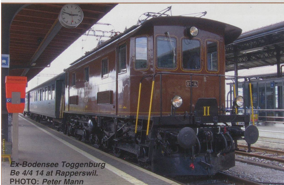
Ex-Bodensee Toggenburg Be 4/4 14 at Rapperswil.

Erstfeld - Not only was the depot open, but the freight loops were also part of the area