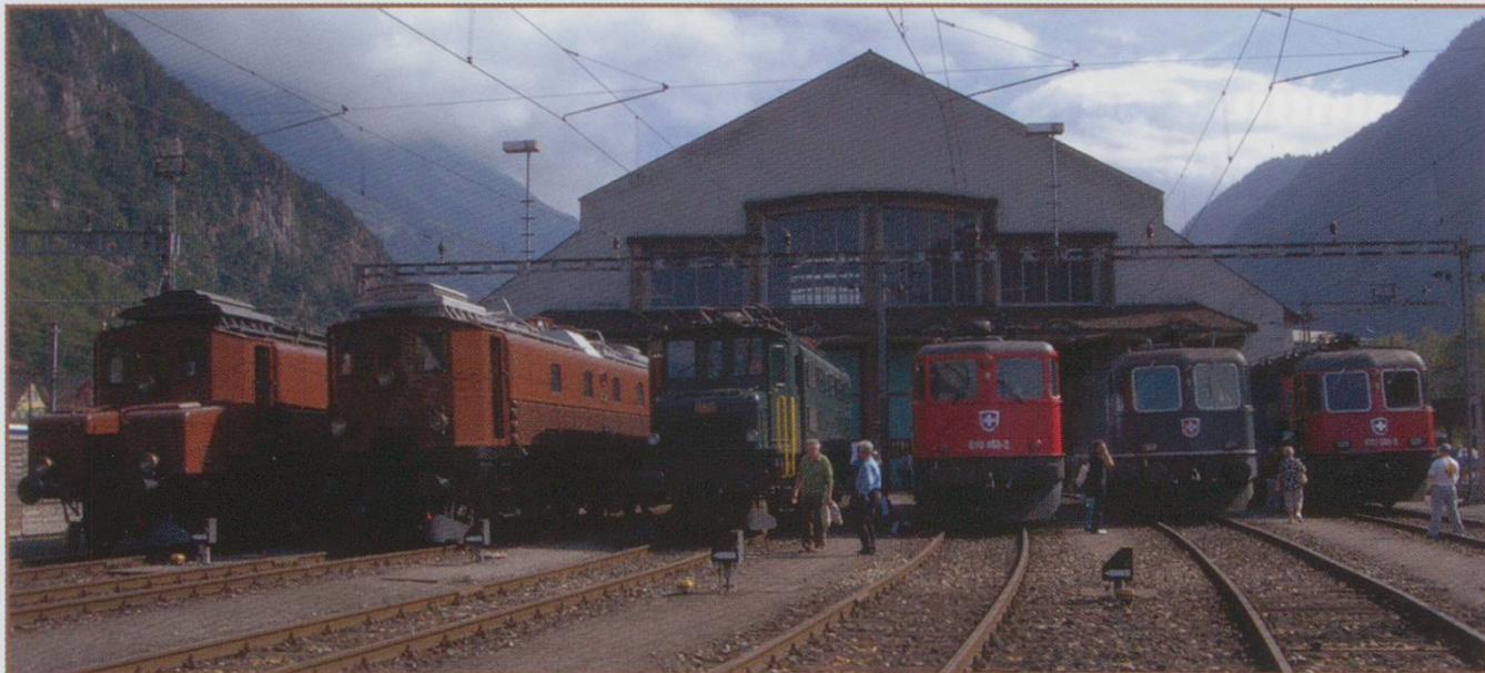
A line up of locomotives outside Erstfeld Depot.