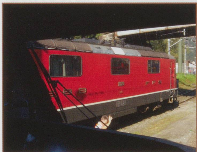
Re 460 giving cab rides passing Re 4/4 11120 at Erstfeld Depot.

used for the display of rolling stock. A wooden walkway was built from the southern end of the island platform across the loops to the exhibition area, so visitors did not have the long walk between the station and the more usual depot entrance. This effectively reduced Erstfeld to a 2-track through station, with the outside of the island platform usable for the terminating local services from/to Zug.