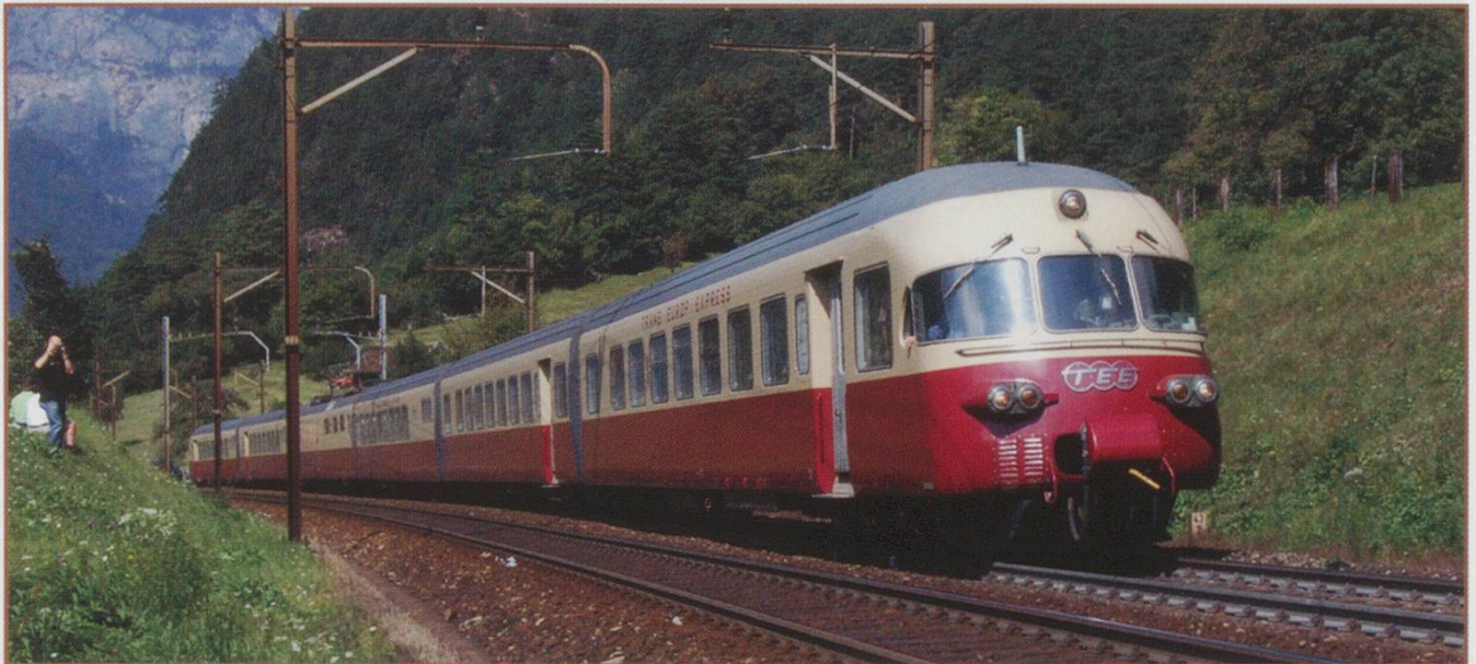
RABe EC 1053 leaving Erstfeld on 8th September 2007.

An assortment of old and new stock was on show including the two Czech 4-8-2s. Historic locos BDe 4/4 1646, Ae 3/6 ii 10439, Ae 8/14 11801, Be 6/8 iii 13302, Ce 6/8 iii 14305, Ae 4/7 10905, Be 4/6 12332, Ce 6/8 i 14201 and Fe 4/4 18518.