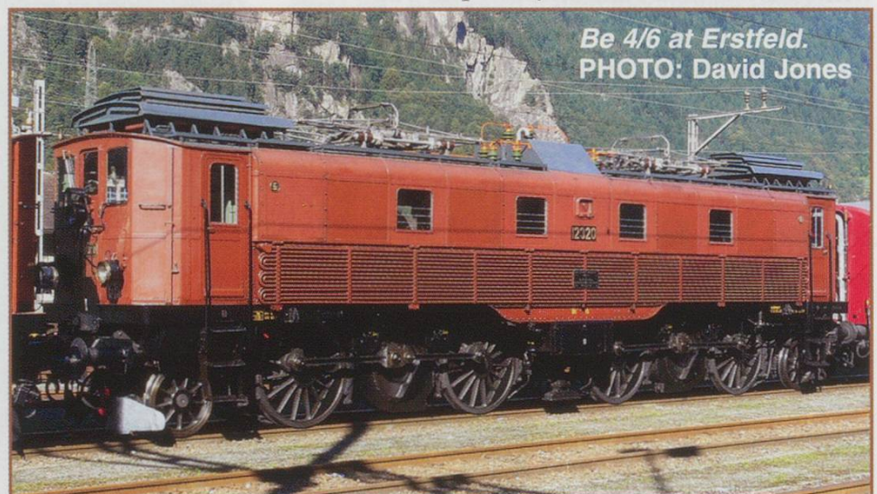
Be 4/6 at Erstfeld.

the EC Cisalpino services were worked by the hired Re 484s in CIS livery hauling CIS-liveried coaches. These locos are normally restricted to the Simplon route. Several of the extra trains were formed of double-unit ICN sets, a foretaste of their introduction into regular service over the route. Whether it was done officially, or was by the contrivance of the line controllers, an unusually high proportion of the Re 460s were carrying advertising liveries. The remaining Re 4/4 ii s in Swiss Express livery (11108, 11109, 11141 at the time) are frequently to be seen on the