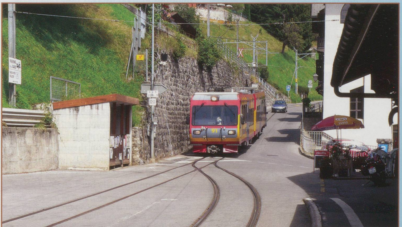
BVB Beh 4/8 No 91 comes down the street into Gryon Station.

thing to consider when travelling on these lines in the summer is the lack of air conditioning in the trains. Given that summer temperatures in the Rhône valley regularly rise to 40°C it is not surprising that the BVB power cars have a prominent fan in the driver's cab!