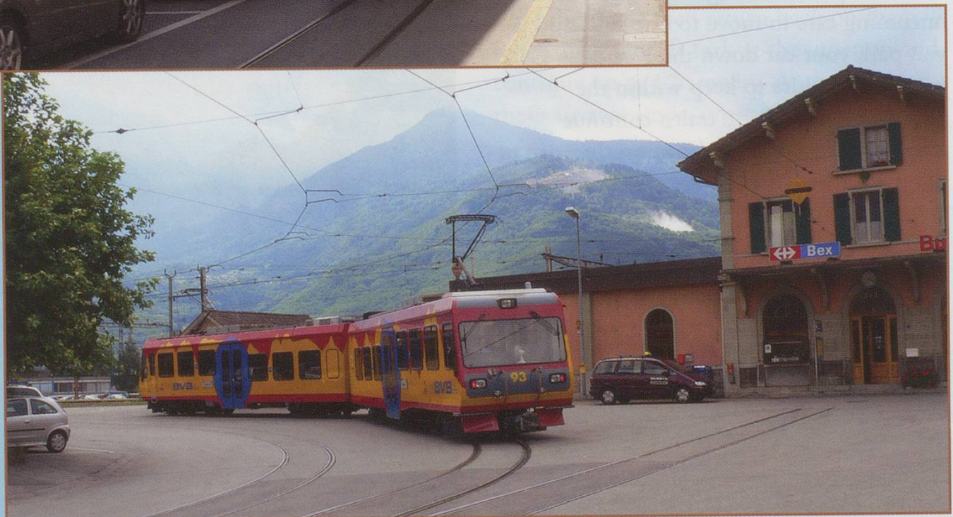
BOTTOM:— BVB Beh 4/8 No 93 waits at Bex Station.