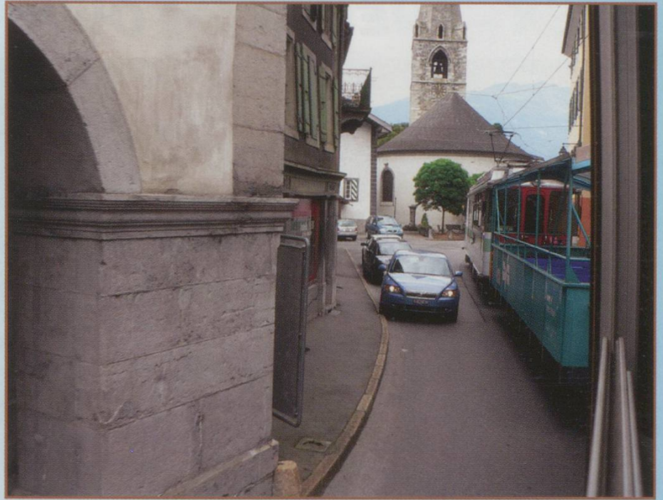
A BVB train approaches the Church of St Clement in Bex; not many passengers were taking advantage of the open coach.

At the end of all of the these lines there are various forms of cable transit to take you further up into the mountains, along with pleasant villages to explore before returning down to the Rhône valley. One