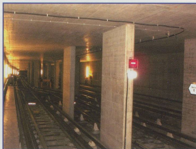
A1:8 incline, and an 80m radius curve, start right at the end of a station. Platform doors are on the left.

Editor's Note: The line will have 14 stations that will be served by the 15 new standard gauge 2-car units. Each unit will have 58 seats and space for 194 standing passengers giving a line capacity of 6,600 passengers per hour at the peak headway between trains of 2 minutes in the central section. The end-to-end journey time will be 18 minutes. The traction current is 750v dc. As all eight axles on each unit will be powered the acceleration will be exceptional. I wonder how the standee passengers will react to the G-forces when a train takes-off from a stop on one of the 12% gradients? I hope that the operator has good insurance cover