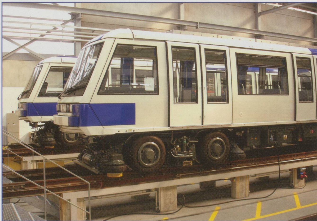
The 2-car sets built by Alstom.