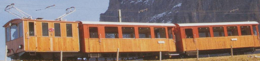
Jungfrau's "Rowanzug" makes its farewell run from Kleinen Scheidegg to Eigergletcher and back.