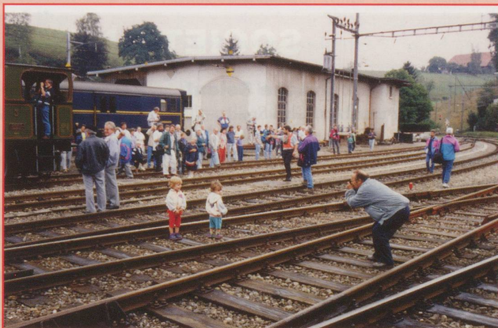
Alan Pike - HUMOROUS Quick before the HSE arrives