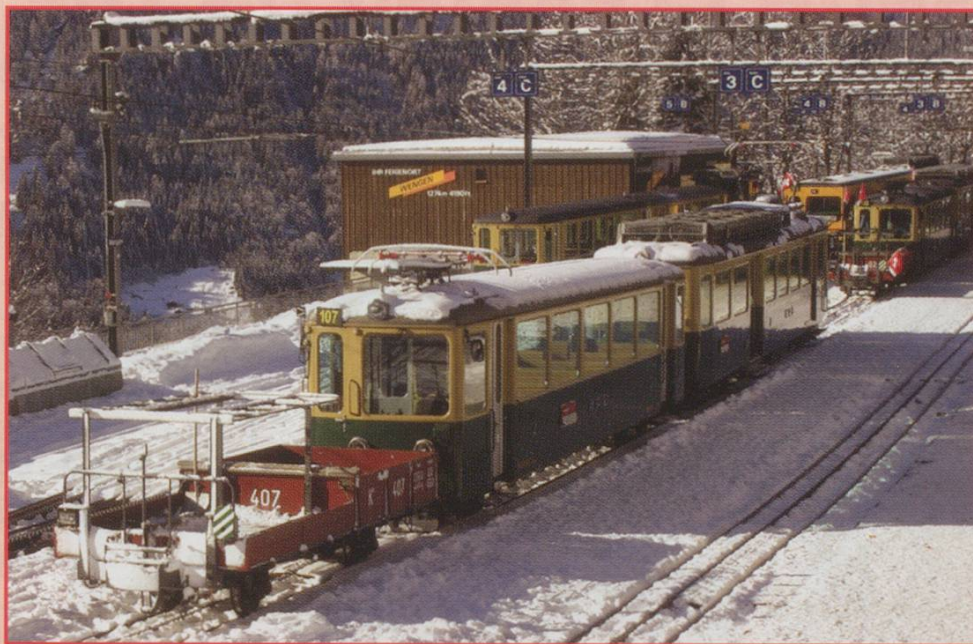
Pam Jones - RAILWAY Lunch Break in Wengen