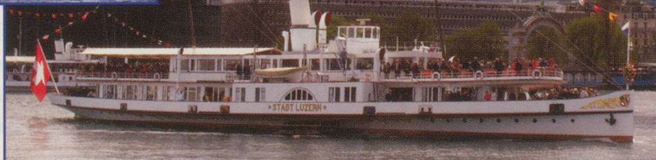
RIGHT: A final tribute picture of "Stadt Luzern" - with Mount Pilatus in the background.