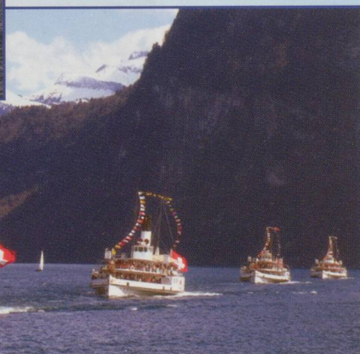
BELOW: Moving into line.