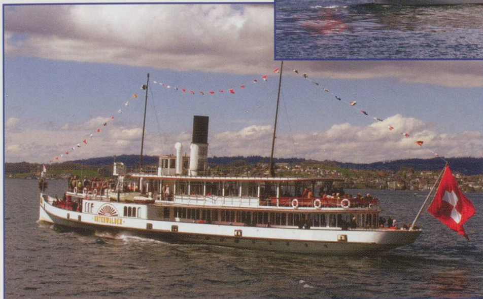
MIDDLE: "Unterwalden" beginning to head for home.