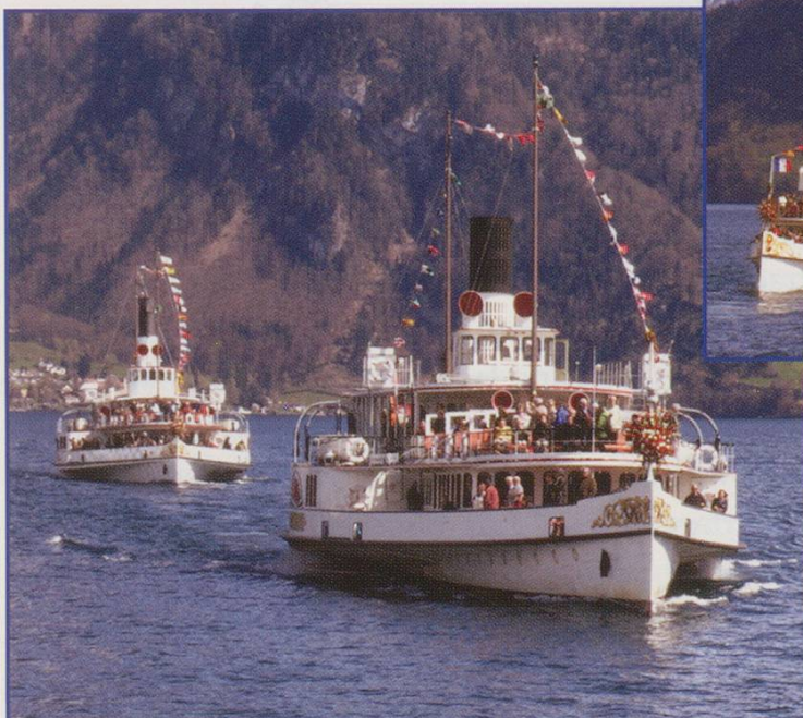
ABOVE: Heading for Home.