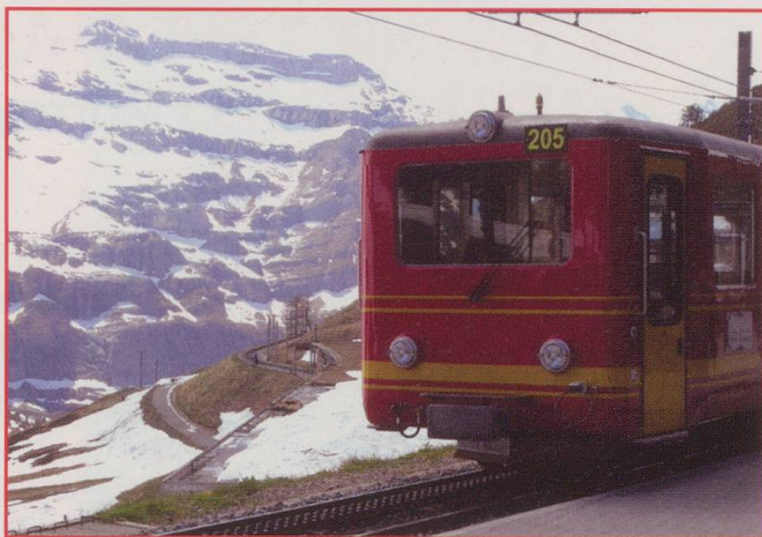
Kleine Scheidegg: Who needs to "climb every mountain" when you can go by train.

BOTTOM: Wengen: Why can't all stations have a view like this?