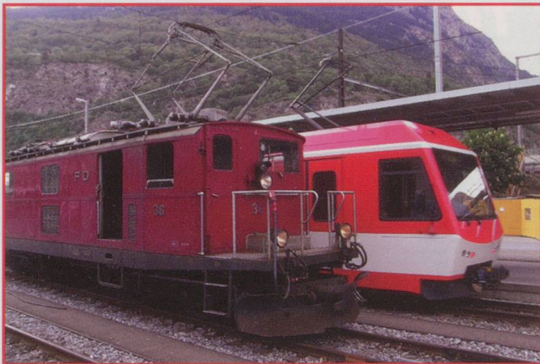
Brig: A contrast between the old (FO HGe4/4 No 36) and the new MGB railcar at Brig.

hurtling downhill to certain doom, but each to their own.