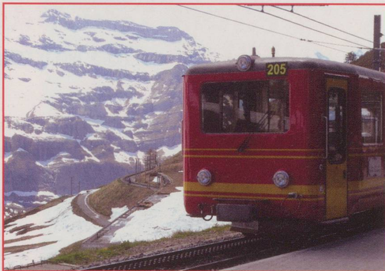
Kleine Scheidegg: Who needs to "climb every mountain" when you can go by train.

BOTTOM: Wengen: Why can't all stations have a view like this?