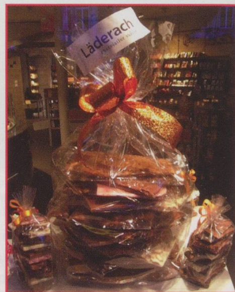
Such window displays do not help a girl's diet.

that both Migros and Co-op have lovely cafés and restaurants where you can get coffee and various delicious pastries and sweets for special offer prices. For lunch we feasted on sandwiches and yet more yummy cakes plus reasonably priced chocolate from Co-op or Denners. There are always plenty of benches available overlooking spectacular views, as well as a never-ending supply of sparrows to Hoover-up after you. In the mountain areas there are handy