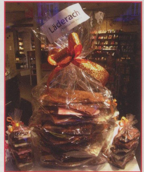
Such window displays do not help a girl's diet.

Murren: Walk a few hundred metres beyond the Schilthorn cable car at the end of Murren, you're rewarded with views like this.