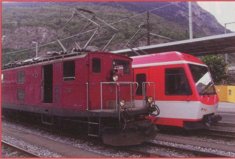
Brig: A contrast between the old (FO HGe4/4 No 36) and the new MGB railcar at Brig.

hurtling downhill to certain doom, but each to their own.