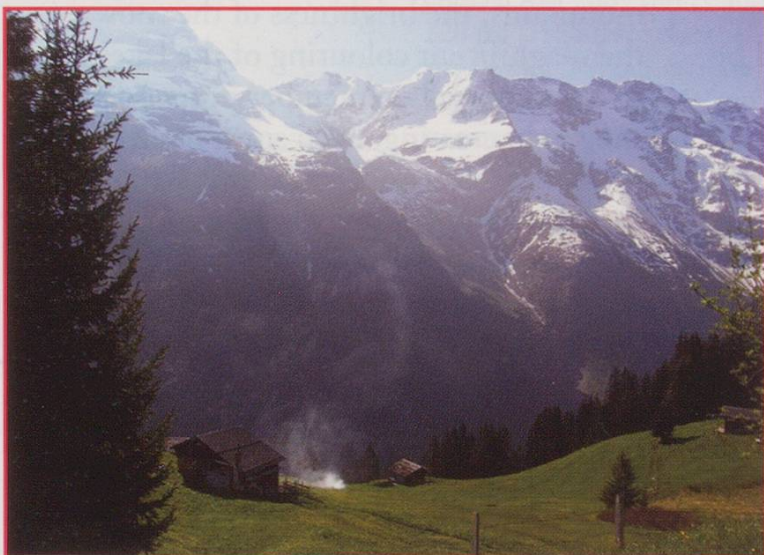
Murren: Walk a few hundred metres beyond the Schilthorn cable car at the end of Murren, you're rewarded with views like this.