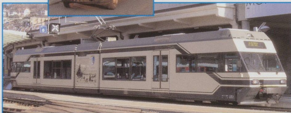
BELOW: MEV Stadler EMU waits at Montreux.