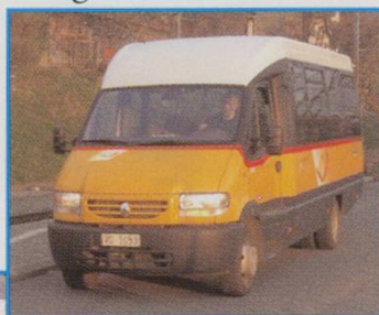
LEFT: Local Postbus waits for commuters at Chernetz.

EDITOR: The cover photograph of June 2007 issue of 'Swiss Express' is also related to this article.