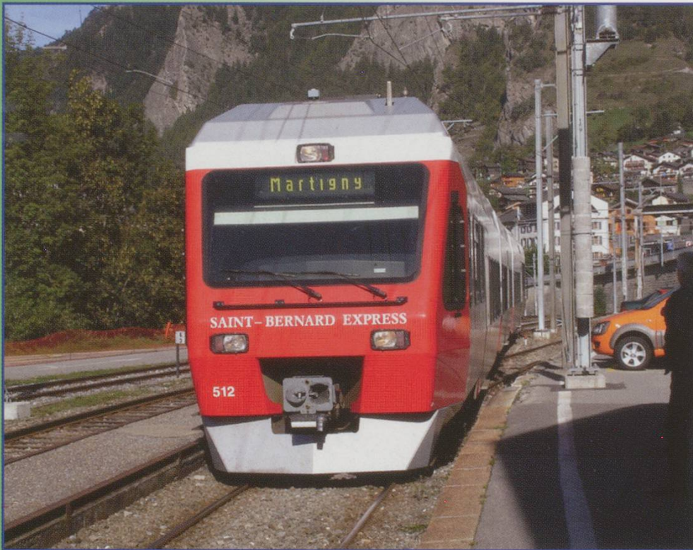
TMR(MO) Saint Bernard Express railcar RABe No.527.51 at Martigny on 8 October 2006