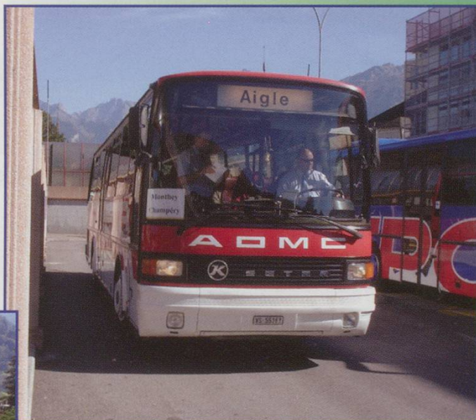
AOMC bus at Monthey Ville station on rail replacement.