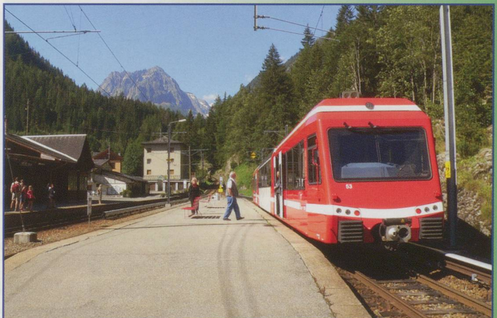
3. MBE No 53 waits at Le Chatelard.