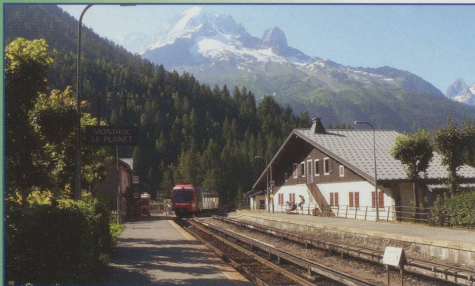
4. A MBE Bdeh 4/8 pulls into Montroc Le Planet on 27/7/07.