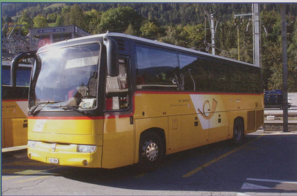
PTT bus at Le Chable (MO) station.

we got up in Kent to the time we walked through the apartment door; including 2-hours of absolute purgatory checking-in and getting through security at Luton Airport! After that the flight and all the transport connections in Switzerland went like clockwork. Anyone who has been to locations like Verbier during the low season will appreciate that many facilities are closed. The first of many encounters that