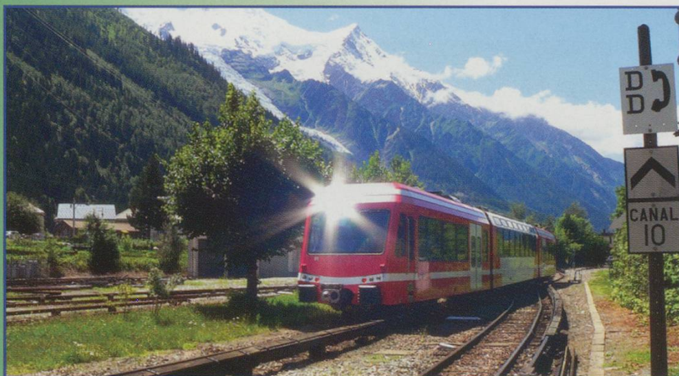
5. The sun glints blindingly from MBE No 53 at Chamonix Station.