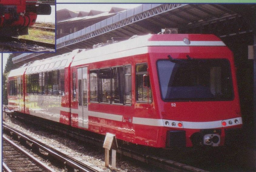
SNCF 'Stadler' Class 2800 EMU No.52 at Chamonix Mont Blanc on 8 October 2006.