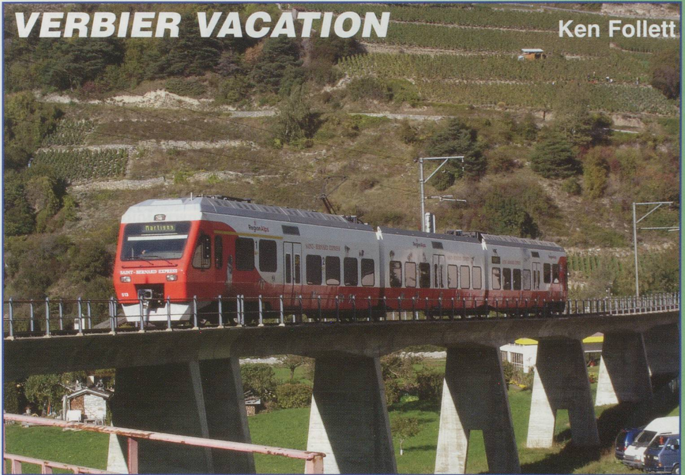
TMR(MO) low floor 'NINA' EMU RABe No.527.513 service from Le Chable on viaduct approaching Sembrancher on 10 October 2006.

The high alpine resort of Verbier is clearly not the most obvious place for a Swiss Railway buff to spend a holiday, but the offer of a friend's apartment to celebrate my 55th birthday was too good an opportunity to miss even though we would be travelling during the low season in October 2006. Verbier lies over 1000m above the Rhône valley at Martigny. We purchased our 8-day Swiss Passes for use on the trip taking advantage of the 7% discount offered at the time to members of the Swiss Railway Society. Thanks; I recovered my subscription (and more!) in one fell swoop.