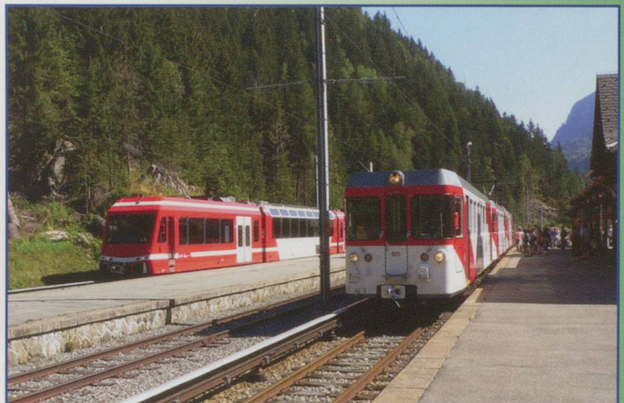
2. Changing trains at Le Chatelard.