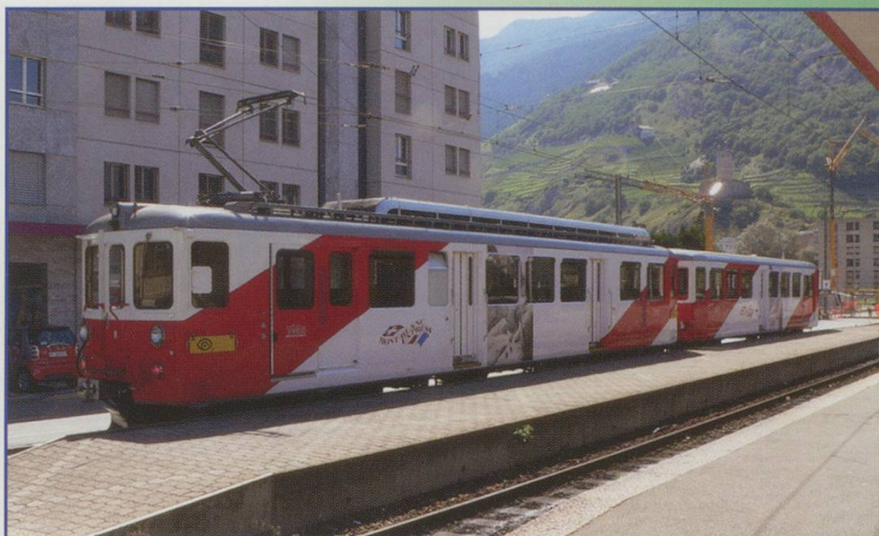
1. MBE Bdeh 4/4 No 8 at Martigny Station with the castle in the background.

After the train enters France there is a long