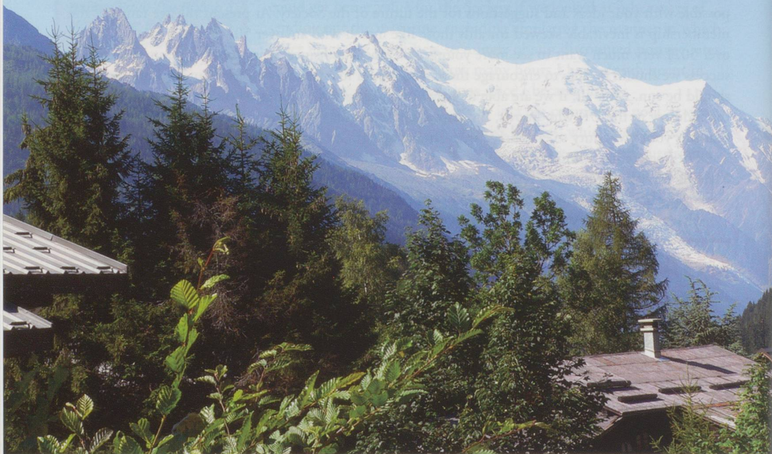
Mont Blanc group from Montroc.