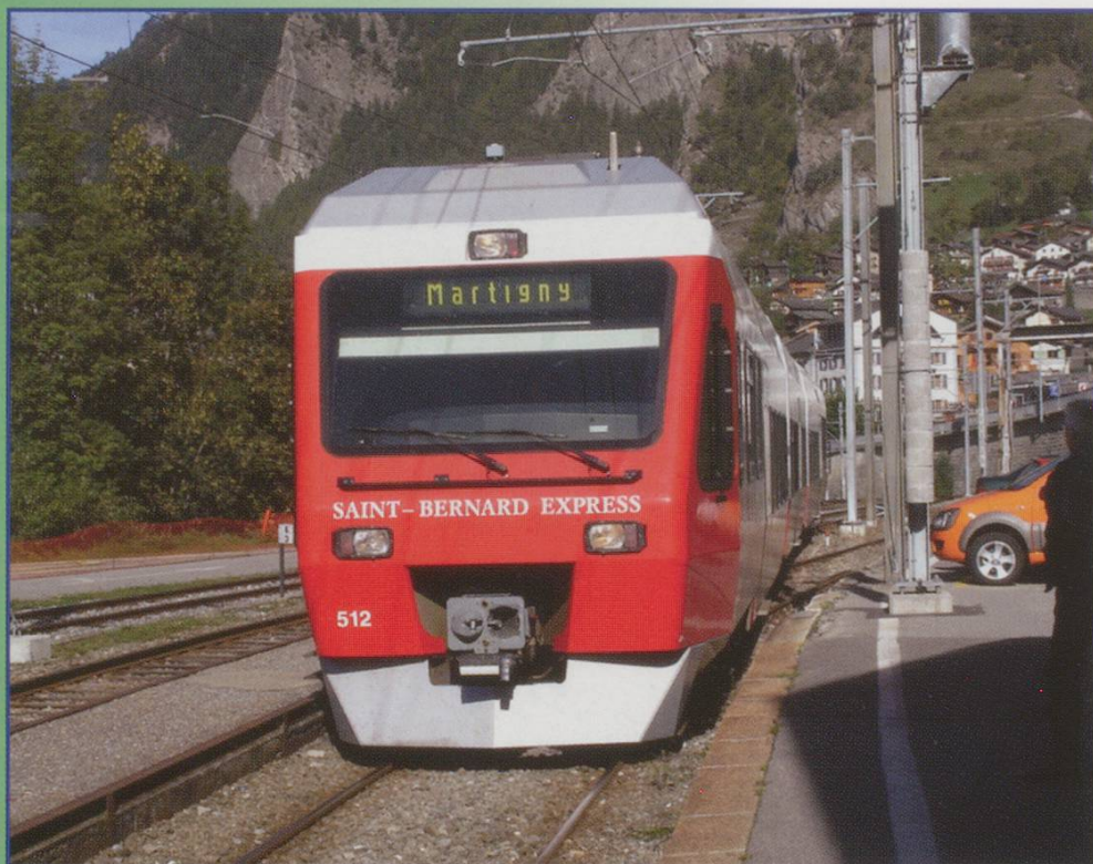
TMR(MO) Saint Bernard Express railcar RABe No.527.51 at Martigny on 8 October 2006