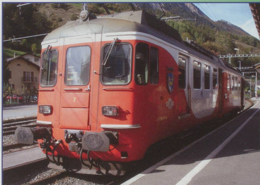
TMR(MO) EMU ABDe 537 No.507 "Martigny" at Sembrancher on Orsieres branch.

Other trips from Martigny included riding on one of the infrequent through trains, formed of a Class 560 EMU, down the line on the south bank of the Rhône to St Gingolph; travelling on the main line to Montreux, Vevey and Lausanne; using the Rhône valley line to Brig; and travelling up to Orsières on the other part of the MO. With excellent autumn weather Verbier in the low season was not such a bad place for a railway buff to stay.