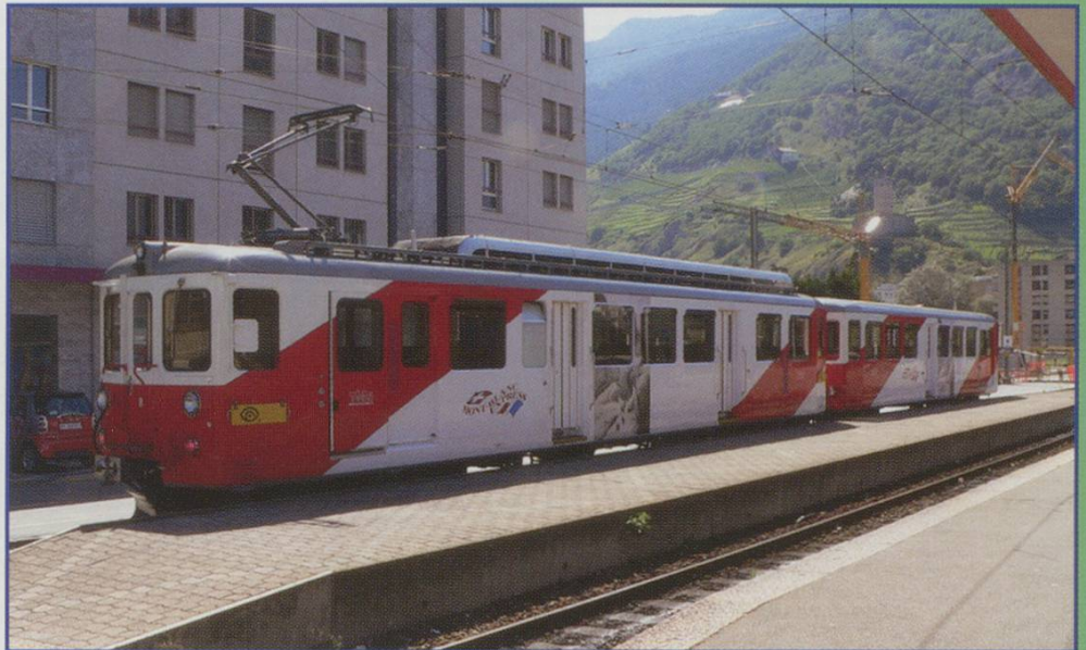
1. MBE Bdeh 4/4 No 8 at Martigny Station with the castle in the background.

After the train enters France there is a long