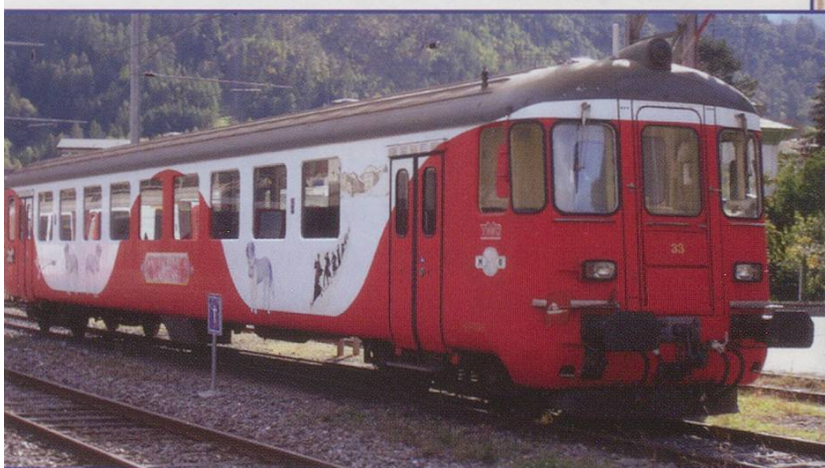
TMR(MO) non-powered railcar No.33 at Orsieres.