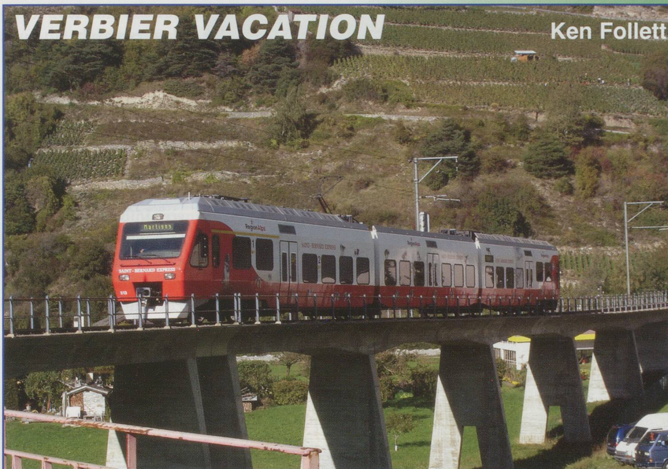
TMR(MO) low floor 'NINA' EMU RABe No.527.513 service from Le Chable on viaduct approaching Sembrancher on 10 October 2006.