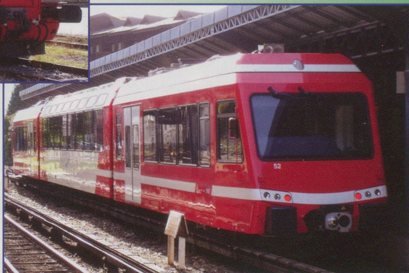
SNCF 'Stadler' Class 2800 EMU No.52 at Chamonix Mont Blanc on 8 October 2006.