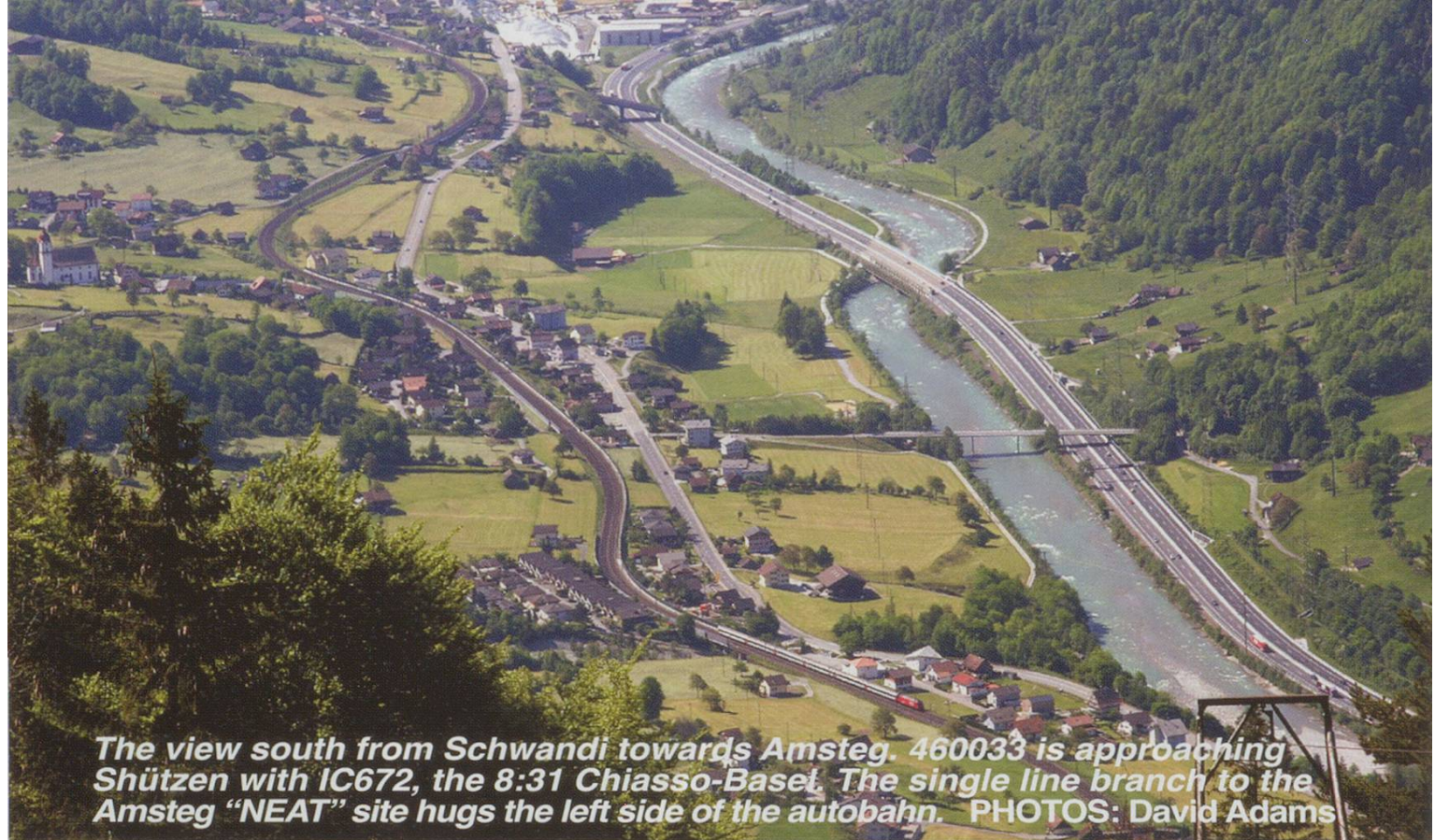
The view south from Schwandi towards Amsteg. 460033 is approaching Shützen with IC672, the 8:31 Chiasso-Basel. The single line branch to the Amsteg "NEAT" site hugs the left side of the autobahn.