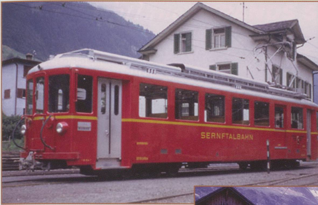
SeTB No. 6 is a CFe 4/4 built by SWS and MFO in 1949 and still at work with the Stern & Hafferl organisation on the Achensee line in Austria. The picture is also taken around 1969 at Elm station. The red livery comes from the colour of the regional arms Glarus/Glaris/Glarona with the Saint Fridolin in black on the red ground.

Following the note in Sidetracks (Dec. Swiss Express ) there is a lot to report on this interesting project. Work has been progressing well, with a hardy band of volunteers working on restoring the old goods shed at Engi. Over 300 man hours have cleaned the accumulated dust and rubbish, and more than 30 kilos of paint has been applied! The museum is well on target to be opened to the public on 18th April 2009. An increasing amount of artefacts, pictures and documents are being accumulated for display. Two of the latest are a diesel engine (still full of oil) from a first generation diesel bus and