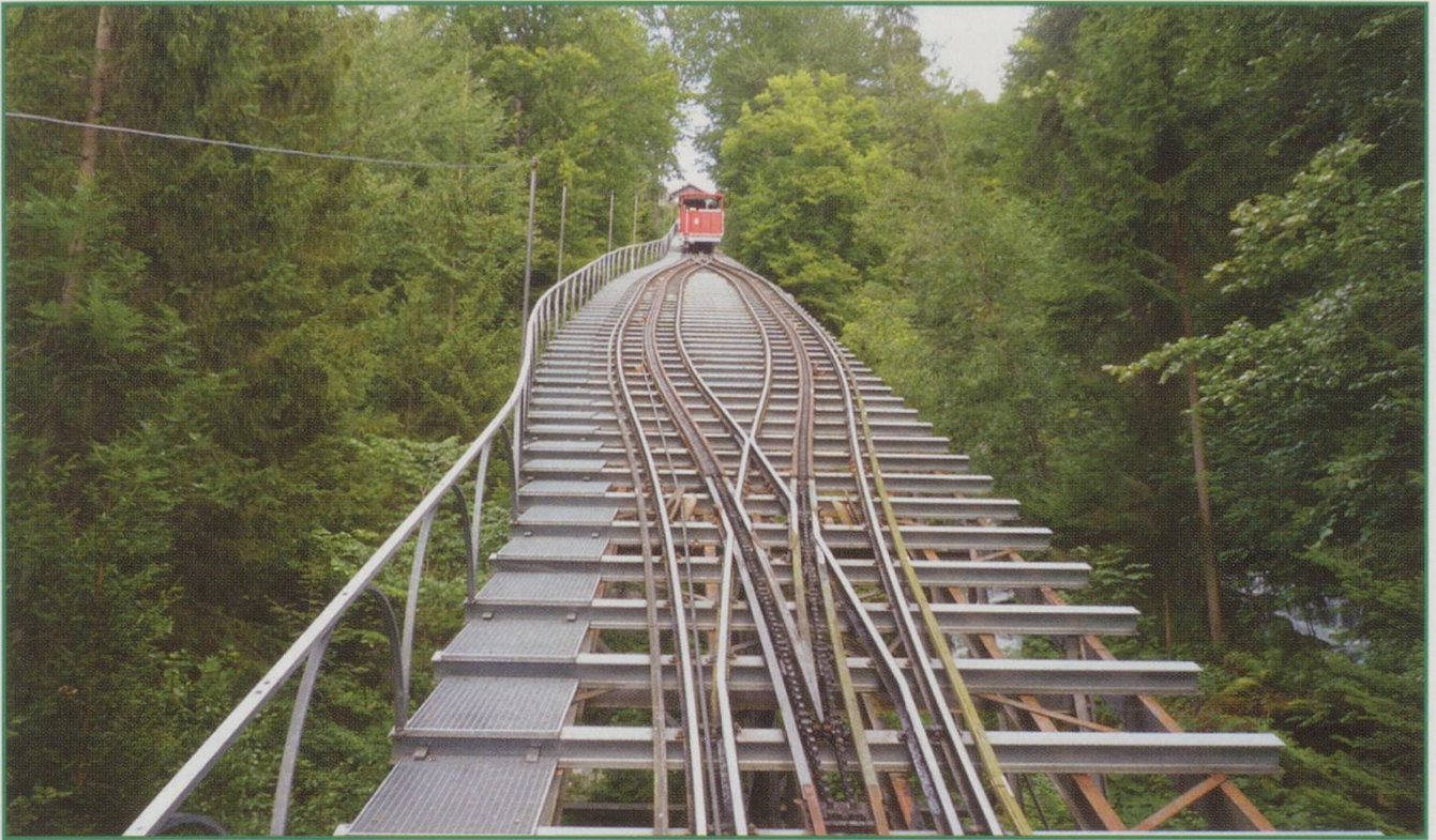
On the way up on the Giessbachbahn.

Now moved by electricity rather than water-ballast, the cabins are still the same as when they were first used in 1879. Even the conductor seems to be selling tickets in the old-fashioned way! The 345m journey takes just 4 minutes as it climbs 90m to the Grandhotel Giessbach where the views are spectacular: the waterfall above, the lake below and the Bernese Alps all around. The keen-eyed will notice the Riggerbach rack between the running rails. This is only used for braking.