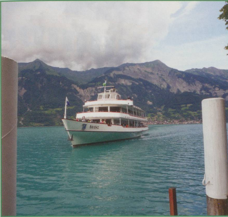
TOP: The "Brienz" arriving at Giessbach See station.