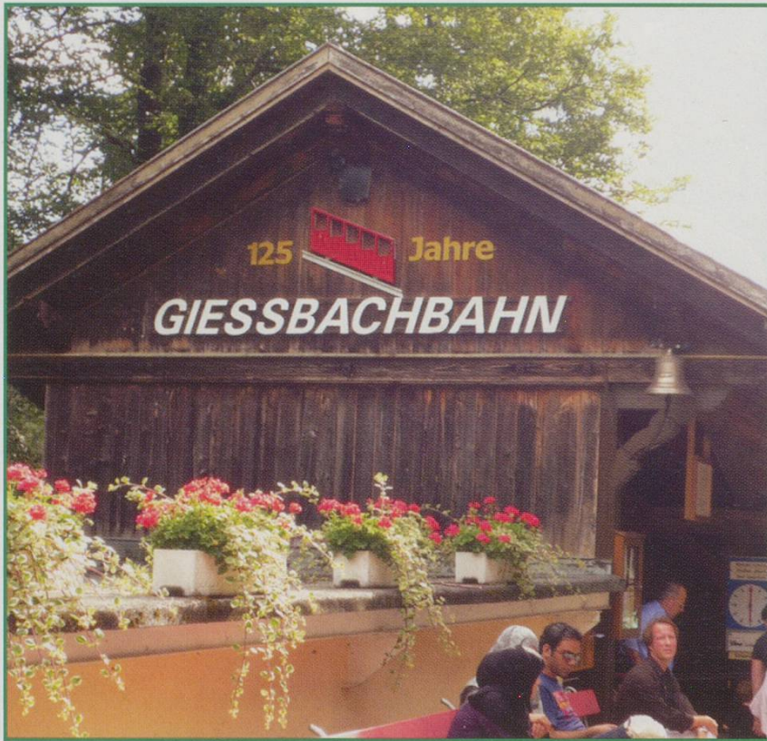
Station building of Giessbachbahn at the falls.

disrepair in the mid 20th century. It was saved from demolition by the “Giessbach to the Swiss People” foundation, which is largely made up of small shareholders. The hotel was carefully restored to its former