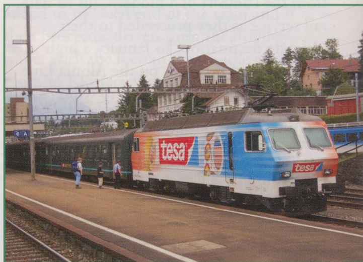
TOP RIGHT: A Voralpen Express runs into Arth-Goldau.

For sale: A large number of Swiss HOm models (mostly MOB) including Bemo, Friho and Fulgurex all in good condition in boxes plus a large number of unused boxed and unboxed Peco HOm points and some new track. For full list Tel: 01276 856051 or Email: montbovon@btinternet.com .