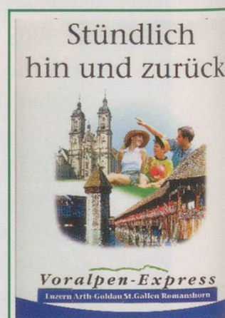
RIGHT: Voralpen Express Poster.

ABOVE: Over one weekend in July 2008 each Voralpen Express was strengthened by three old green coaches and a banking loco was added to the rear for the run up the hill.