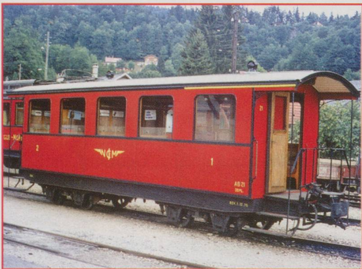
TOP: View of St Cergue with Be4/4 202 shortly to return to Nyon, September 2008.