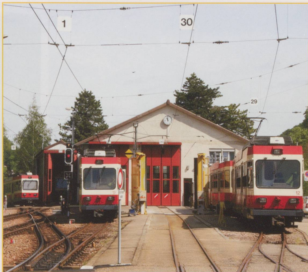
WB BDe4/4 units 11, 13 & 12 outside Waldenburg depot.

On another day in May this year I took the Südostbahn (SOB) Voralpen Express from Arth-Goldau to Wattwil. From there a SOB FLIRT RABe 526 049 worked the connecting branch train for the pleasant run to Nesslau which took 16 minutes. The first