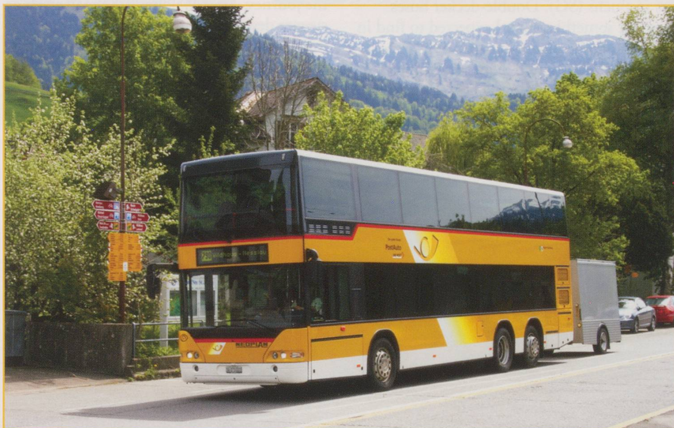
"NEOPLAN" double decker post bus and luggage trailer arriving at Nesslau to form the 11:55 to Buchs SG.