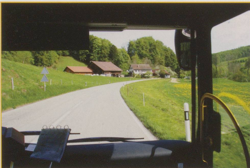
View from the Postbus nearing Langenbruck.

On arrival at Balsthal there is a seven minute wait for the bus connection to Waldenburg, which I nearly missed. I had already ascertained that it was Route No. 94 and shortly before the 10.32 departure time a double-decker showing No. 94 arrived, but then went empty to the depot. A "MAN" single decker showing No.129 arrived soon after and I continued to look down