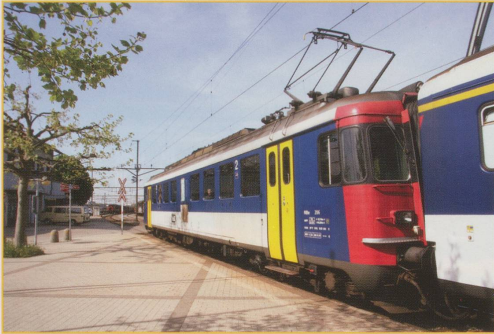
OeBB RBe 540 206 at the rear of the 10:17 to Balsthal.

Thalbrücke, the 4 km journey only takes 8 minutes. An Em4/4 diesel shunter, No. 22 (former Class 345 of DBAG(D)), was shunting near Klus. All other rolling stock seen was stabled at the Balsthal terminus. This consisted of another Class "540" unit No.205 (ex SBB 1421) and a Class "560" unit No.207 (ex SBB 560000). Also present were three De4/4 motor coaches numbered 641, 651 & 1632 (ex SBB BDe4/4 1641/1651/1632) which are used for freight haulage. All OeBB's rolling stock is second hand and the last time I saw No.651 was in 1996 when it was working the staff shuttle between Basel SBB and Muttenz.