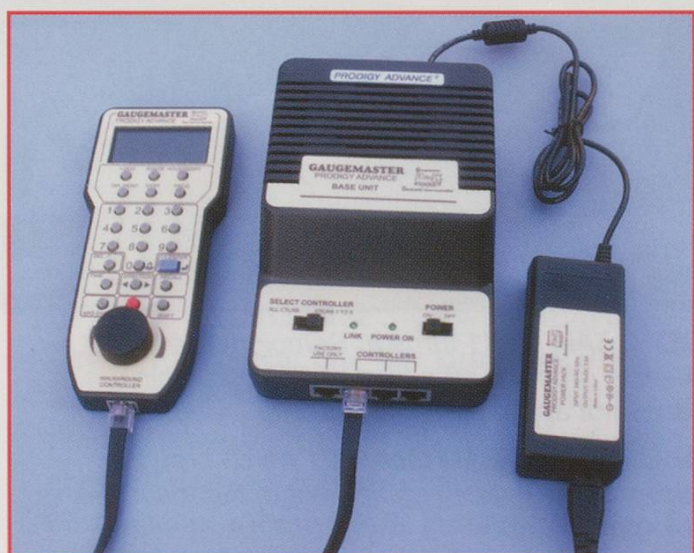
Gaugemaster Base Unit and hand-held controller.