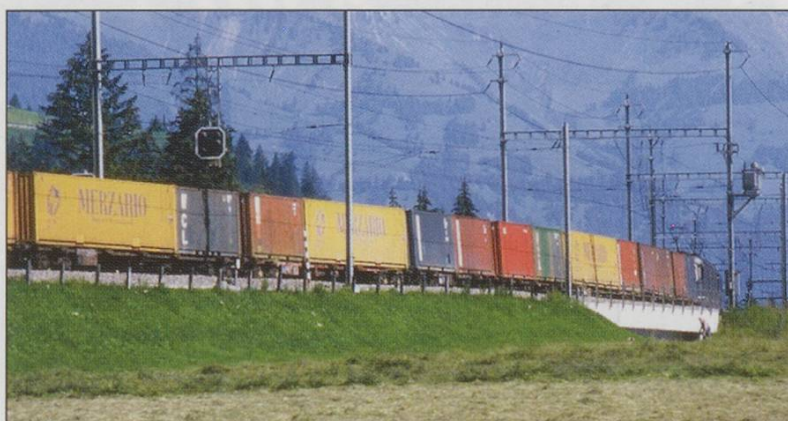
BOTTOM: Merzario (Italy) was an Italian forwarder and big early user of Intercontainer. This is a Milano-Zeebrugge train, with SBB locos, entering the north ramp near Kandersteg, in the mid 70s.