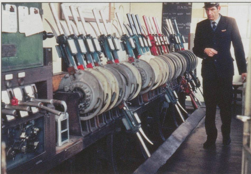
BOTTOM: 'Bruchsal' lever frame, at Cossonay station, 17/10/1968.