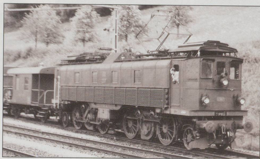
TOP: BLS Ae6/8 206 (SLM 1938) at Spiez on a pick-up freight in September 1969. My daughters started young.