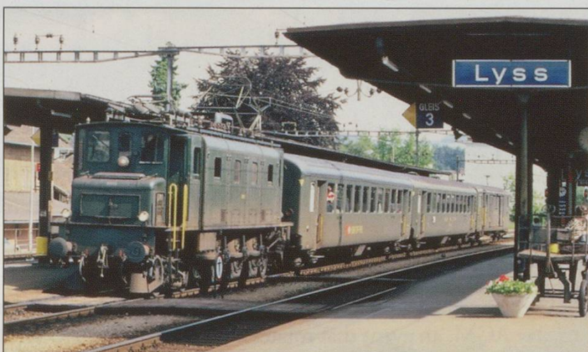
TOP: A rare bird: Ae 3/6 III 10264 (SLM 1925) on 16/04/1969, on Delémont local in Basel SBB.