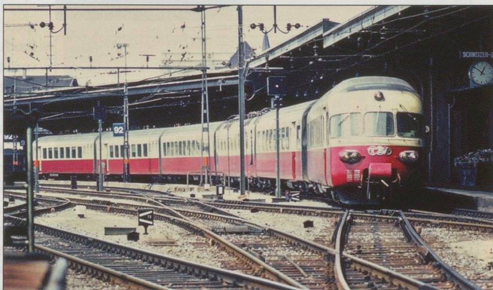
TOP: Sun and fog in the last days of Weesen old station, with Ae4/7 10916 (SLM 1927) on a local from Sargans to Ziegelbrücke, 02/03/ 1968.