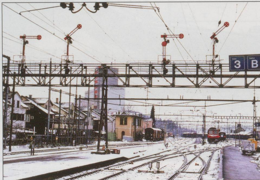
TOP: Snow at Brünig-Hasliberg, 1978 : Local with DeH 4/6 (SLM 1941) waits for the incoming express to Luzern, with HGe 4/4 I ('Muni') 1992 (SLM 1954).