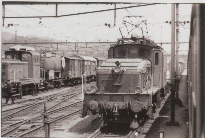
BOTTOM: Ce6/8 III 13315 (SLM 1925) on a mixed freight at Olten, mid 1967.

International trains rolled day and night over the mountain lines. I counted over 40 regular booked sleeper trains, often the heavyweight Wagon-Lits cars, and many more trains with couchettes. The Gotthard had fourteen 'night' trains each way, not counting extras and seasonals; in total twenty-six internationals crossed the Gotthard each way daily, and twelve more the BLS still, remember, single line on the south ramp. From Britain to Basel ten services ran via Lille, Dieppe, Belgium or Holland. The Arlberg Express had 10 different through sections on its Swiss leg. Little remains; the typical international train, 12 to 16 cars of different colours, shapes and sizes, has disappeared, and nocturnal shunting in Basel is correspondingly calm. Switzerland had six TEE trains; express trains ran through Vallorbe, Les Verrières (the