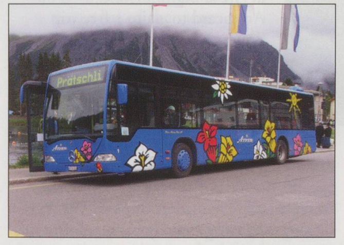
Arosabus 1, the Mercedes Benz Citaro, awaits the arrival of the train at Arosa Bahnhof on 15 August 2008.

Every summer visitor staying in Arosa receives an Arosacard which gives free use of the local bus, cable cars and the railway as far as Langwies (2-stops down the line). Casual visitors must purchase a Day-card for CHF8 as single fares are not available on the buses or cable cars. Needless to say, the