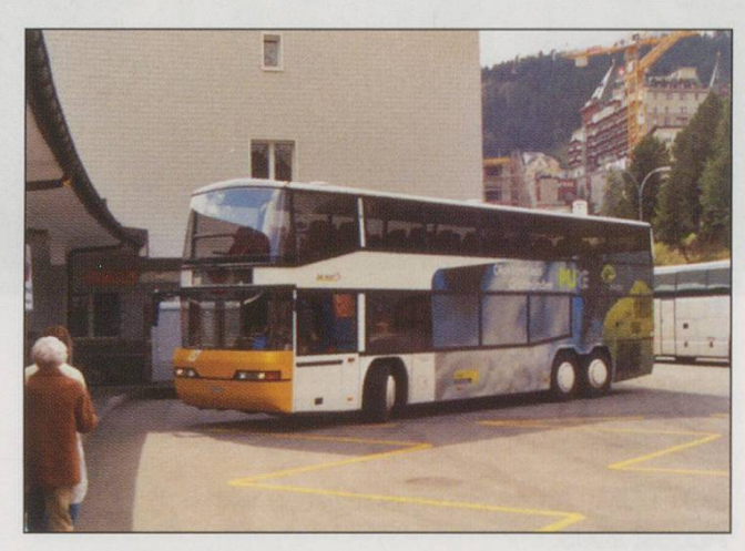
Post Auto at St Moritz preparing to leave for Chur, 13/07/2005.

Using Arosa as a base for excursions means regular trips down-and-up the line to Chur but we never tire of this. From Chur, the whole RhB system is accessible and the PostAuto station is the starting point for a range of delightful scenic excursions by road. The trip to Davos via Lenzerheide is a particular favourite, and you can continue