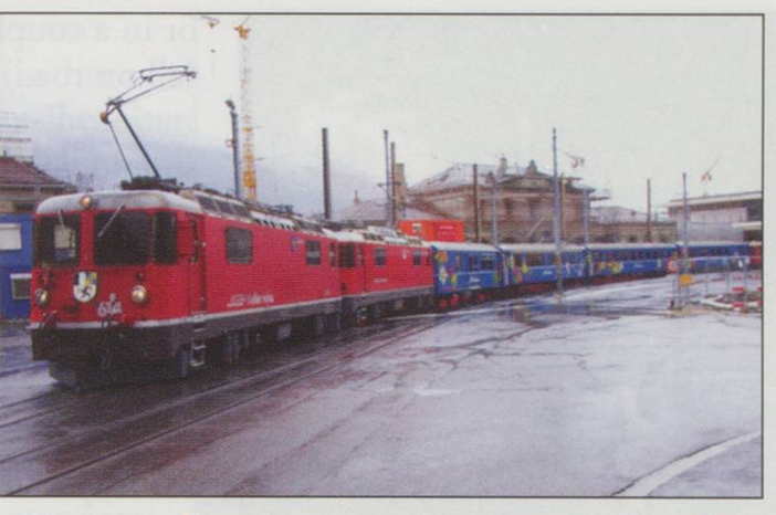
The Arosa Express leaves Chur on a wet Sunday morning, 6/07/2006, double headed by 614 Schiers and 622 Arosa.

half hourly bus service around the village is very popular, not least with hikers who can begin or end their walks at the edge of the village. In summer there is a peak vehicle requirement of two vehicles, rising to five in the winter sports season, but falling to one out of season. The whole fleet consists of low floor standee city buses with 3-doors. Three buses are in the same blue livery as the Arosa Express train and the Weisshorn cable car; of these No.1 is a Mercedes Benz Citaro new in 2006, Nos.2 and 8 are